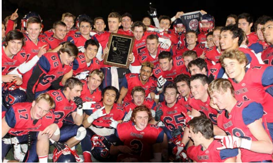
An ecstatic Cougar football team will return to the State title game.