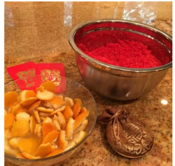
Authentic annual Ceremonies traditionally kick off the festivities for a positive New Year Photos provided