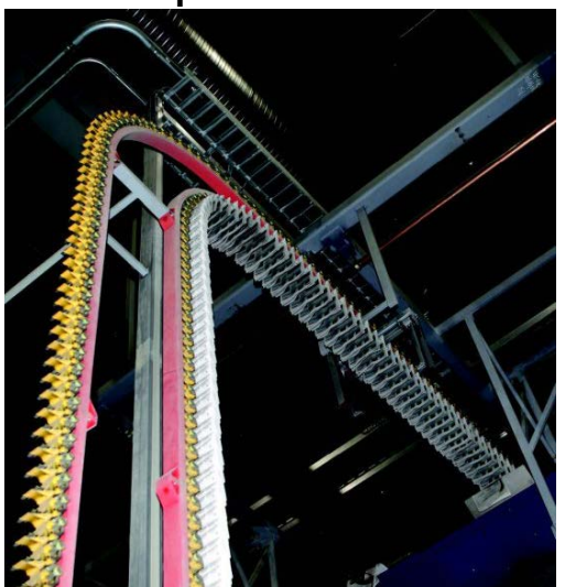
Printed copies travel through the plant

The Lamorinda Weekly is printed at Transcontinental Printing in Fremont.