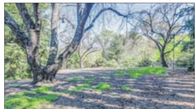
114 Cora Court is an adjacent .38 acre lot Offered at $400,000