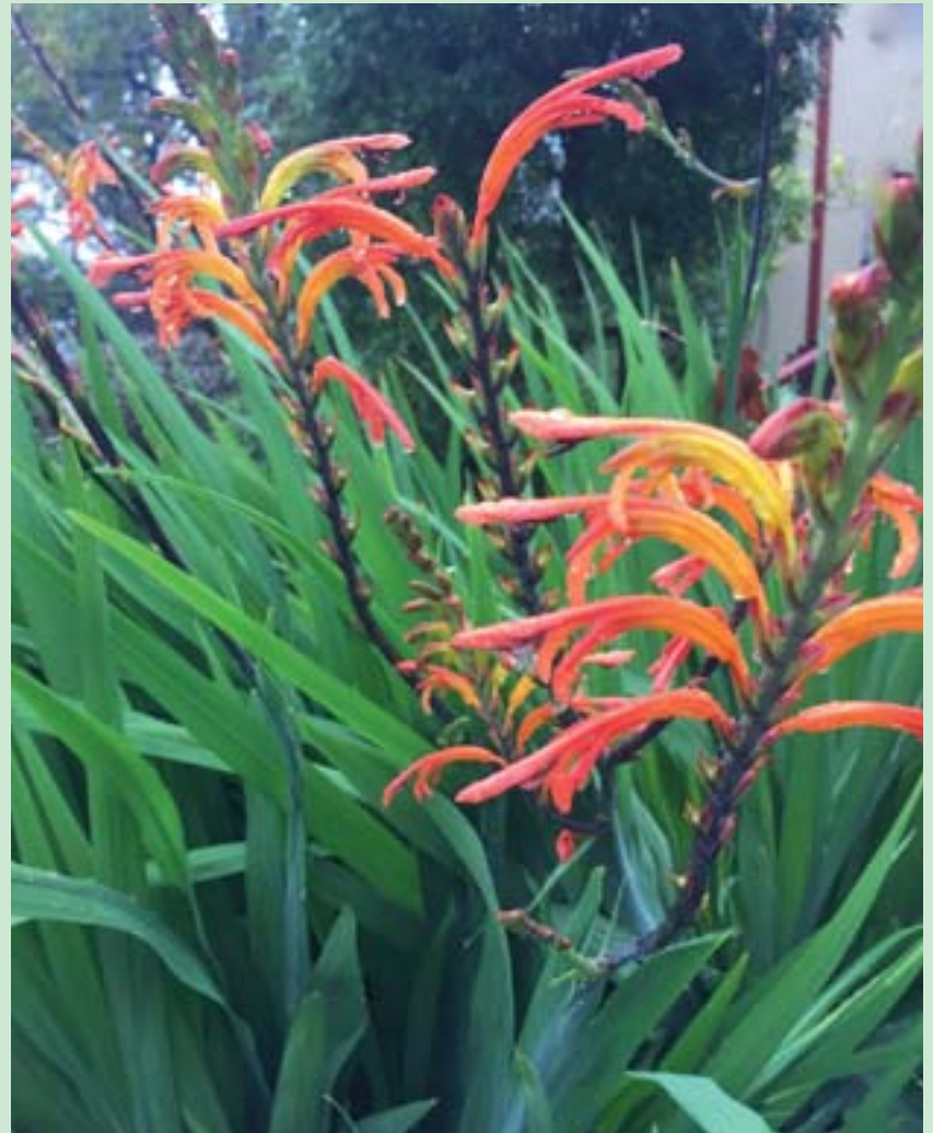
The bright blooms of crocosimias.