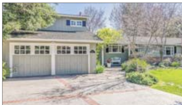
110 Cora Court Offered at $1,200,000

This incredible property provides a special respite from a busy world! Spacious living room with hardwood floors, wainscoting and Marvin windows. Craftsman-style kitchen opens to a cozy sitting room with a fireplace and a large light-filled family room. Rich wood windows and doors allow views of the park-like setting on .50 Acre. Bonus room can be a home office or playroom. French doors lead to a patio with a pretty bubbling fountain. Two large bedrooms share 1.5 bathrooms. A charming breezeway leads to a one-room au pair with a full bath and kitchenette. The back yard has meandering paths, a pretty arbor and an array of beautiful plants. Imagine the possibilities!