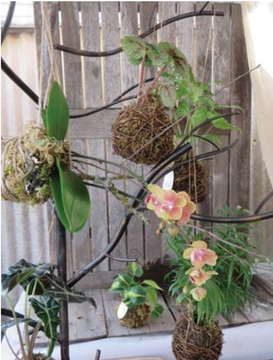
Kokedama in the Japanese art of string gardens.