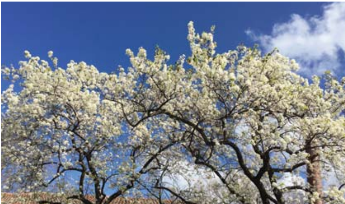
The bright white blossoms of a flowering pear tree.

“May the road rise up to meet you, may the wind be ever at your back. May the sun shine warm upon your face, and the rain fall softly on your fields.” — Irish Blessing