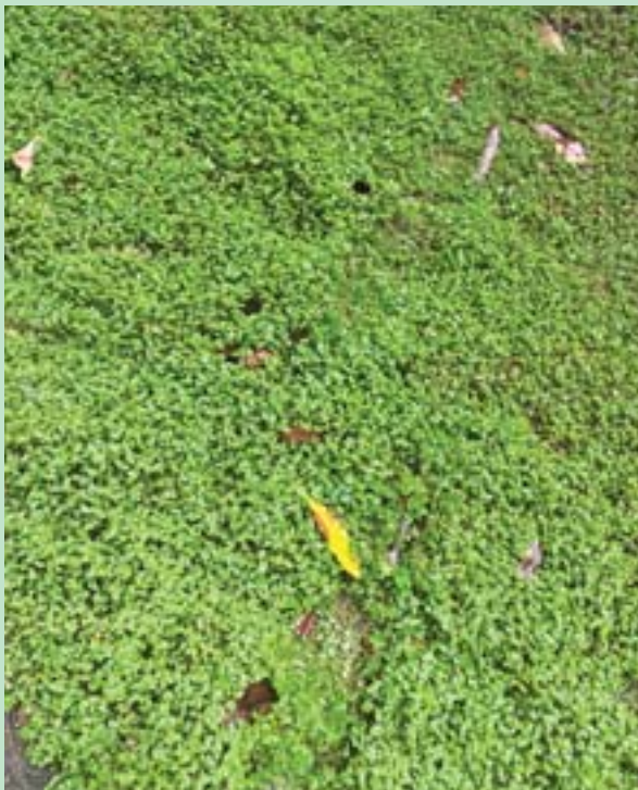
A bed of Baby Tears.