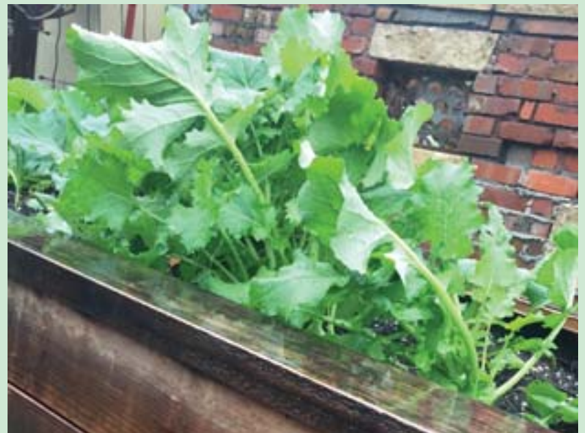
Raised beds with edible greens and lettuces.