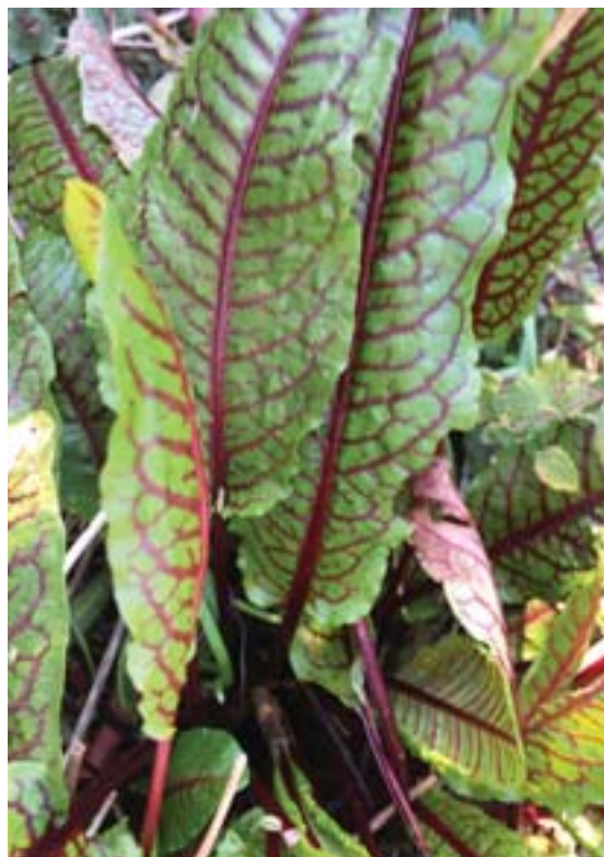
Red-veined dock, part of the Rumex genus, is an edible lemony-tasting sorrel.

Although I don't have an ounce of Irish in me, every March I get excited to celebrate St. Patrick's Day. Besides the fact that the beloved rebirth of nature is officially only days away, my adoration of the Emerald Isle is deep-rooted. My good fortune as a child was to be taught for eight full years by dedicated, intelligent Irish nuns, and to be mentored by Irish priests who had my best interests at heart. I danced throughout California in an Irish dance troop and one of my best friends in the world is my Irish pen pal, whom I met through letters crossing the Atlantic at the age of eight. My Irish first-grade teacher and I are still in constant correspondence. She always told me she kept a leprechaun in her pocket just in case she needed a trick or two. Fortunately I've been blessed to spend many weeks with these friends in their very green country where I've been officially christened an "honorary Irish woman."