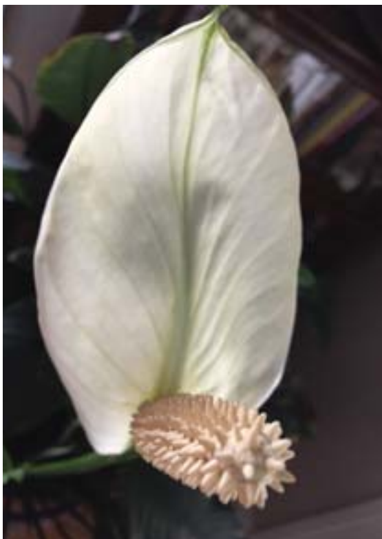
A close up of the Peace Lily.