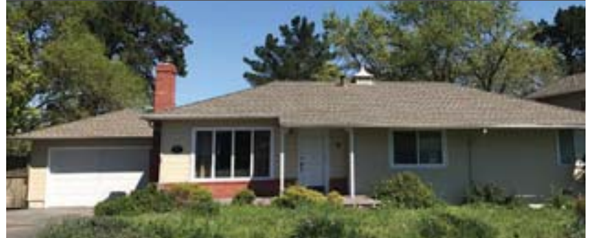
3280 Sweet Drive, Lafayette

Lovely ranch style home with unlimited potential on a sunny, flat parcel backing to a creek. Ideal location close to downtown and the trail. Represented the Buyer