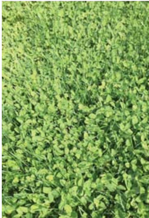
A close up look at clover as a lawn substitute.

Remember that maintaining your lawn enhances the environment, improves your health, and optimizes your enjoyment of the great outdoors. And that's great grass!