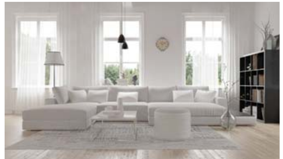
Create spaces for the next season. Leave some areas undone, so the next piece of your journey can find its way in.