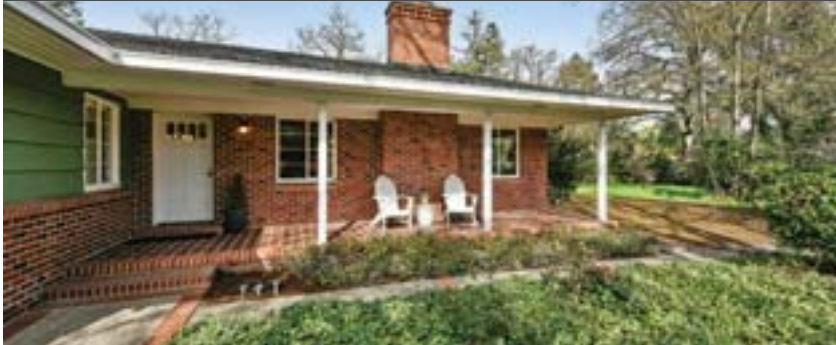
3518 Rowe Place, Lafayette