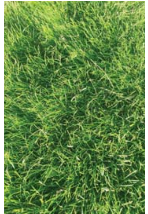
Pearl's Premium lawn two days after mowing.