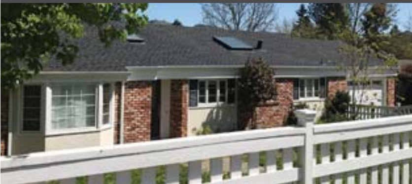
255 Tharp Drive, Moraga

Darling single-story 3BR/2BA, 1525± sq.ft. home on a .25± acre lot on popular Sweet Drive. Views of the hills from kitchen/family room. Sunny deck and large backyard.