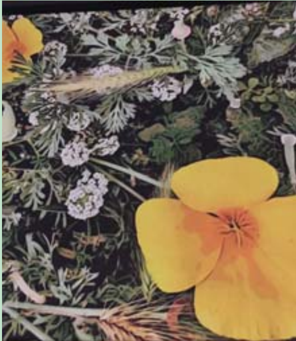
Visit home/made Kitchen & Bakery for creative digital floral photography by Anne Rabe.