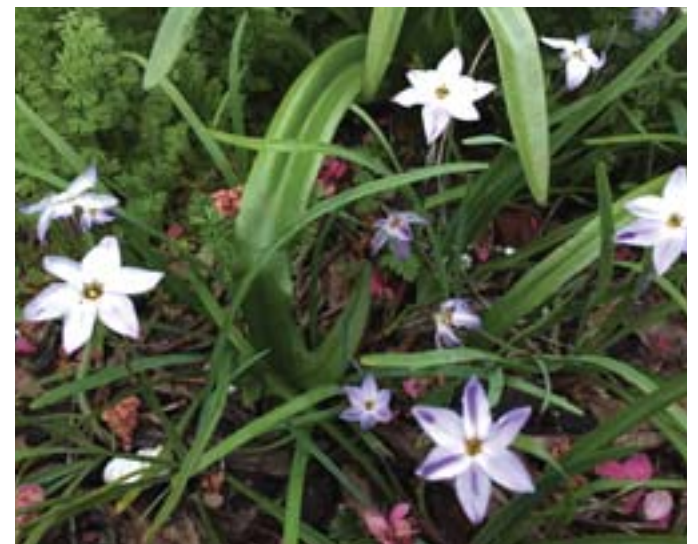
Blue star grass amidst the fallen petals of peach blossoms.