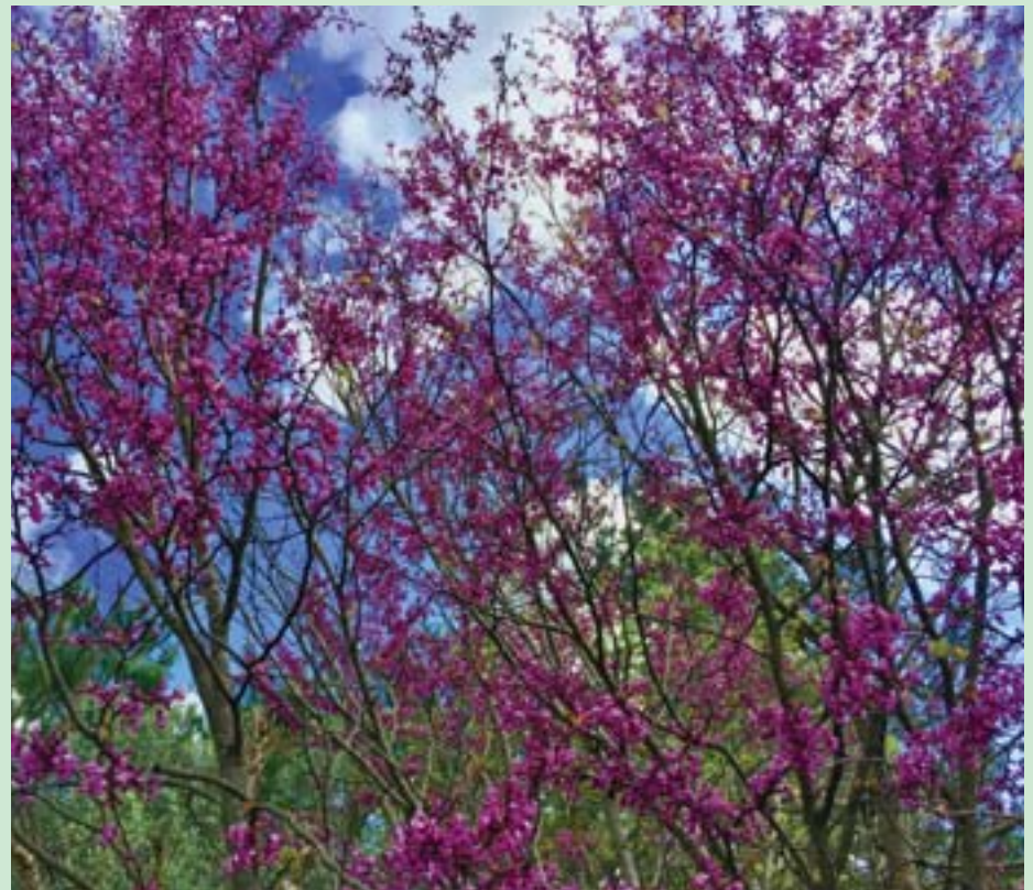
Western red bud is a gorgeous native tree with deep pink/purple blooms.

WIN $50,000 FOR YOUR GARDEN: As a judge in America's Best Gardener Contest. I encourage you to enter to win $50,000. Show the world that your thumb is the greenest by showing the world pictures of your garden today! www.americasbestgardener.com