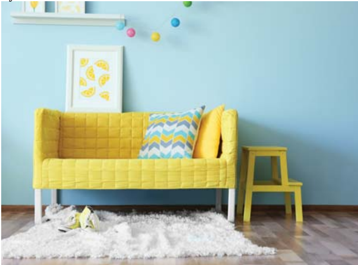
Color has a huge impact on our lives. If the thought of a complete removal or overhaul is daunting, consider using simple, smaller elements. We see side table/stool, pillows, artwork, and even a bench used here. Practice in children's rooms or family rooms to ease yourself in. Photos provided

H ow are you, Lamorindans? My heart hopes well. This spring has been such a precious time in Lamorinda, all the rains bringing blooms before their time. I am loving it.