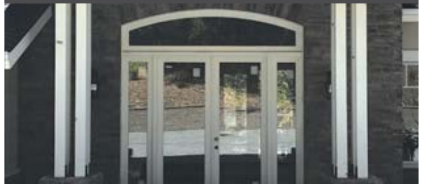
731 Miner Road, Orinda

Charming one level 4BR/2BA, 1956± sq.ft traditional on a flat .25± acre lot. Open kitchen/family room combo offers access to backyard with pool and garden area.