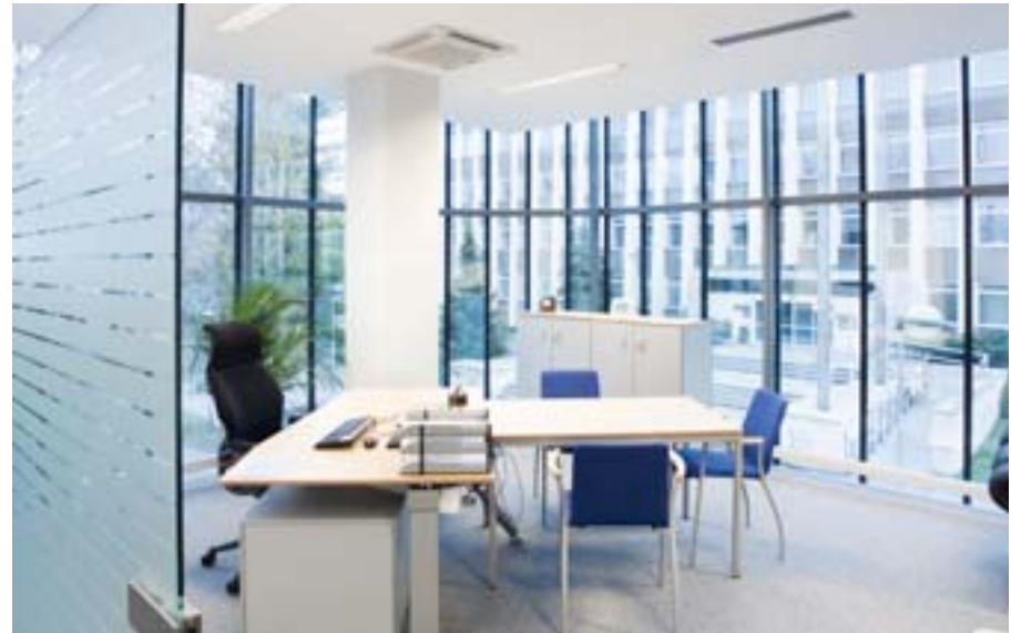
Consider the office: Contemporary or traditional, it matters not. The design of the systems and structures to host the office are always the most up to date. We don't fill it with low speed dial up phones.