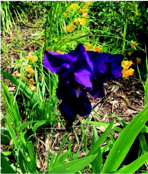
Deep purple bearded iris.