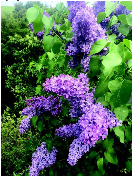
Fragrant French lilac.

"God gets mad if you walk by the color purple in a field somewhere and don't notice it."- Alice Walker, "The Color Purple"