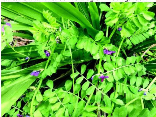
Purple vetch is a nitrogen-rich cover crop