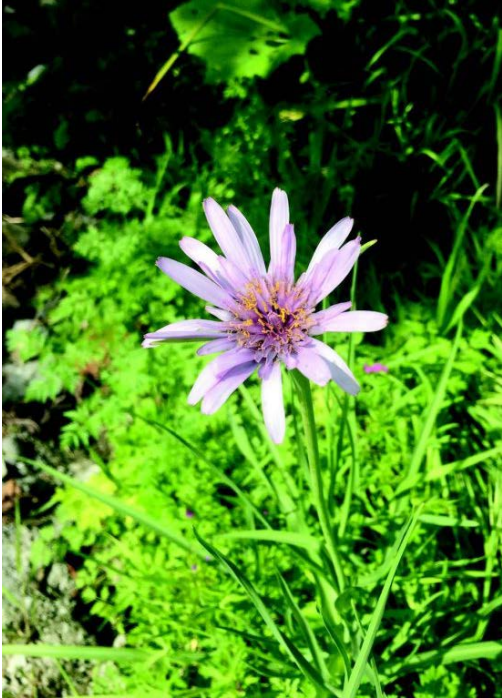
Jerusalem star, also known as goat's beard.