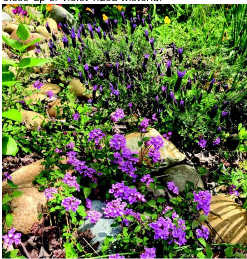
Lantana and lavender comingle in rock garden.