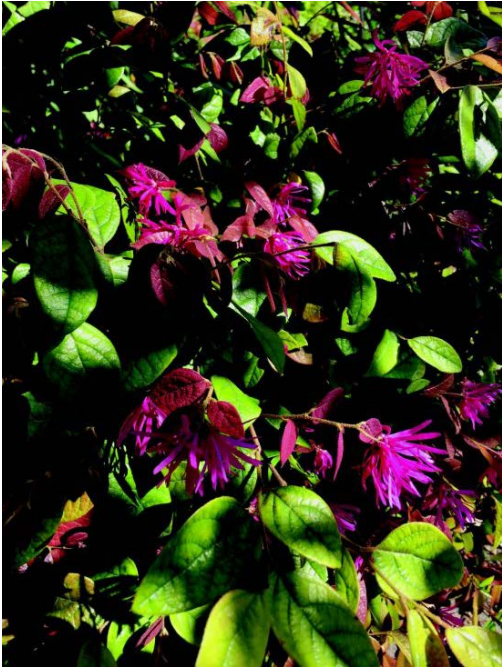
Chinese Fringe with its plum colored flowers.