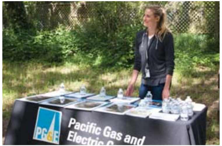
A PG&E employee is ready to answer questions.

Several residents questioned whether money wouldn't be better spent improving the safety features such as gas leak detection and shut-off valves.