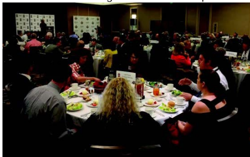
Land Home Financial Services Inc.

Reach the reporter at: info@lamorindaweekly.com