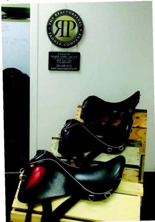
ReactorPanel Saddle Company.

Three saddlery, tack, and bridle stores, with three different stories, have been created in the Lamorinda area to serve the robust equestrian community here.