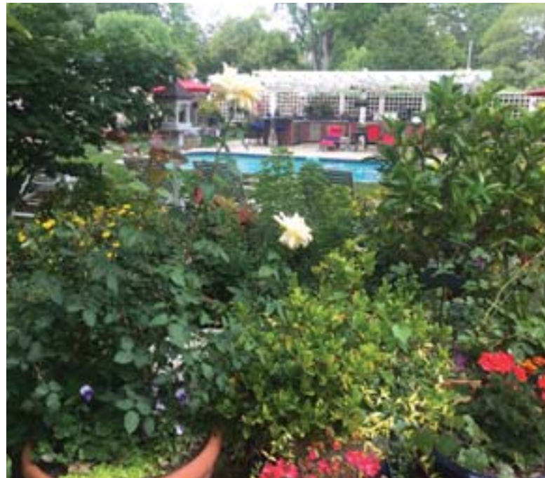
Densely planted pots, a birdhouse, the swimming pool and outdoor kitchen offer relaxation.