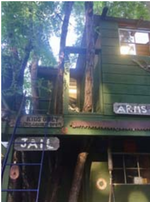
The kids-only tree house built from reclaimed barn wood and vintage signs.