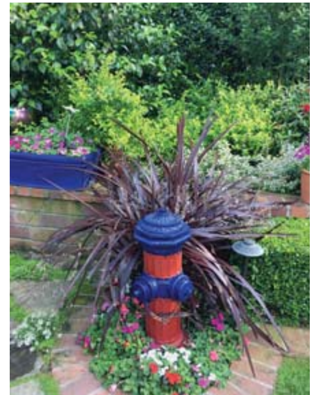
A red and blue painted vintage fire hydrant set among the impatiens and plantings.