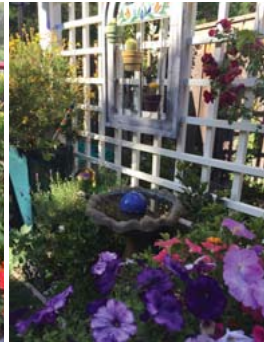
Cactus hang on the lattice while purple petunias and lavender flank the bird bath.