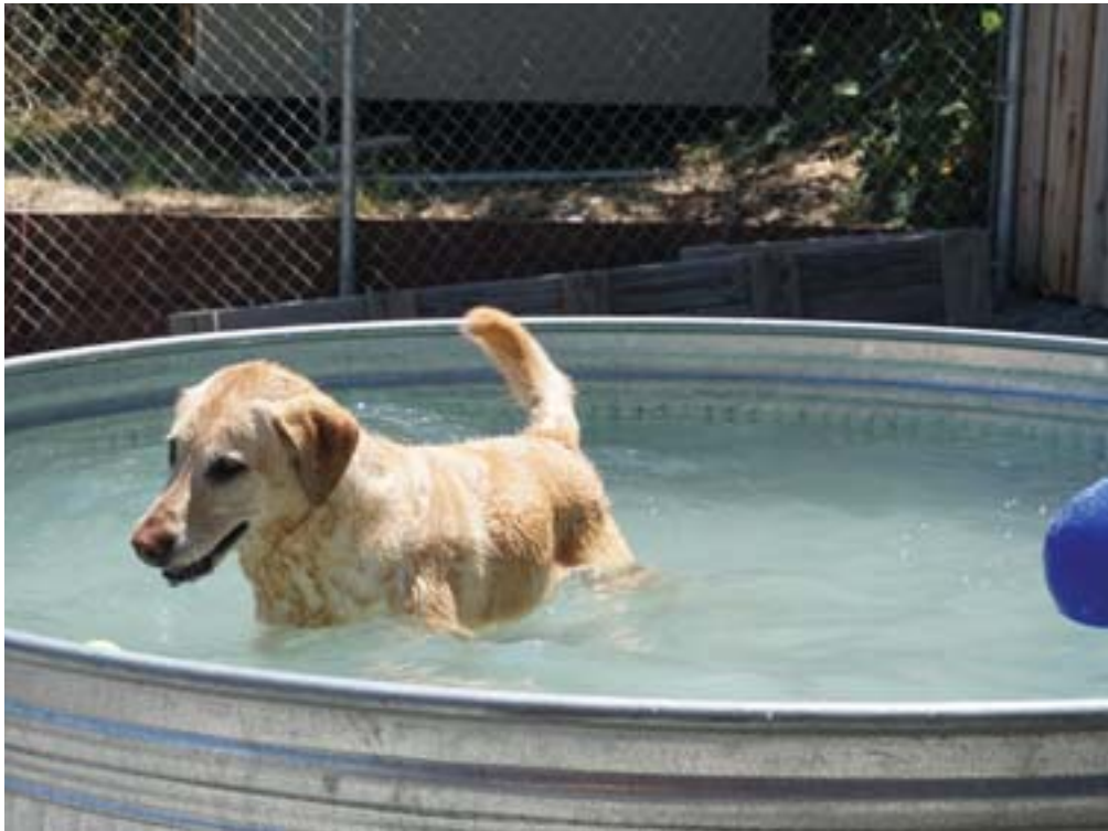
Stella the Labrador enjoys pool time at Canyonwyck.