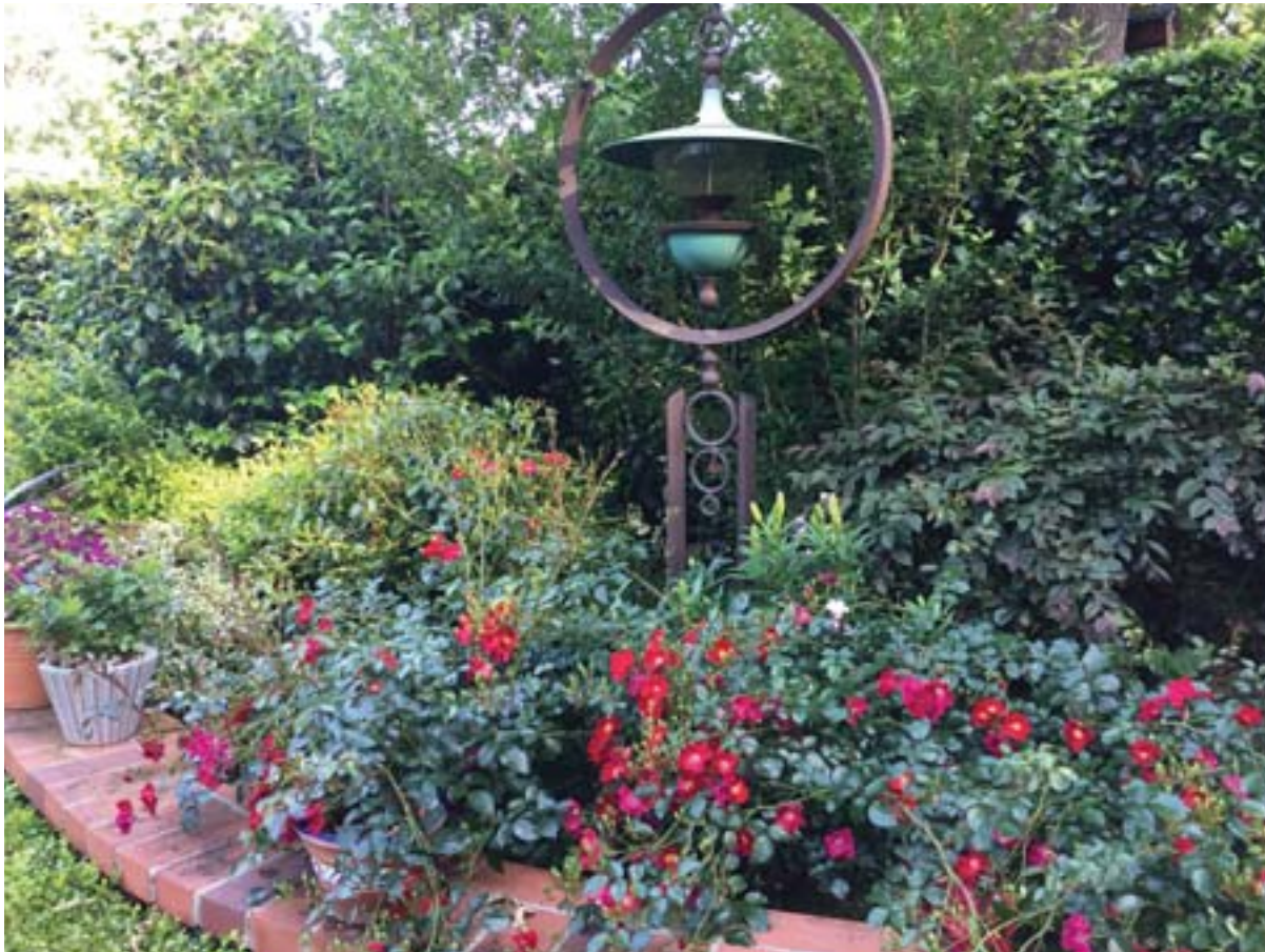
A bricked flowerbed filled with red carpet roses, Asian lilies, and a cast iron lantern.

"The only limit to your garden is at the boundaries of your imagination." —Thomas D. Church