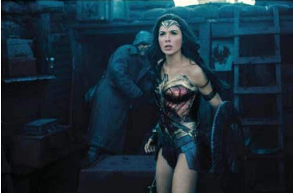
Gal Gadot as Wonder Woman.