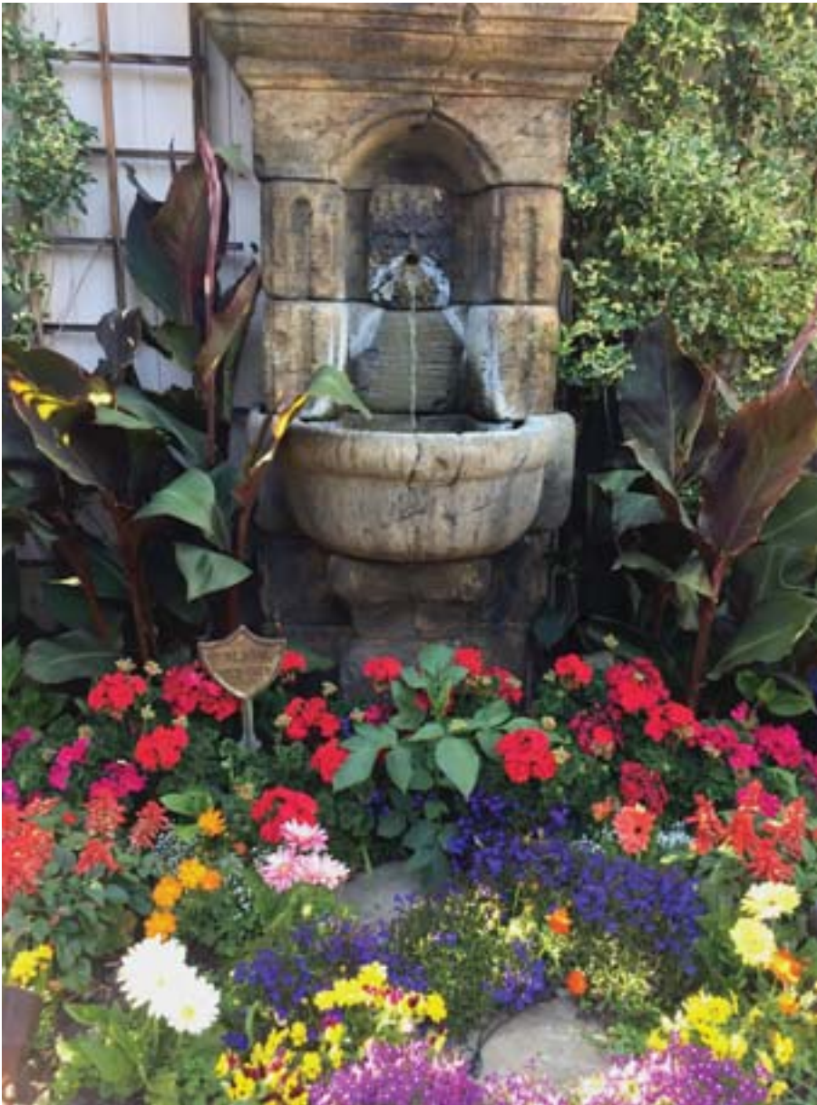
One of nine fountains in the lush landscape.