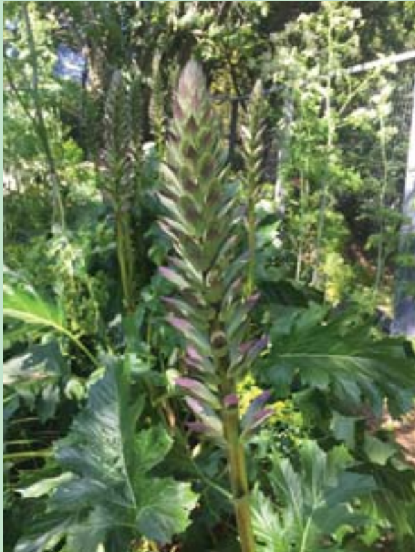
Acanthus spinosus is the inspiration for the popular architectural and decorative ornamentation motif originally introduced by the Greeks.