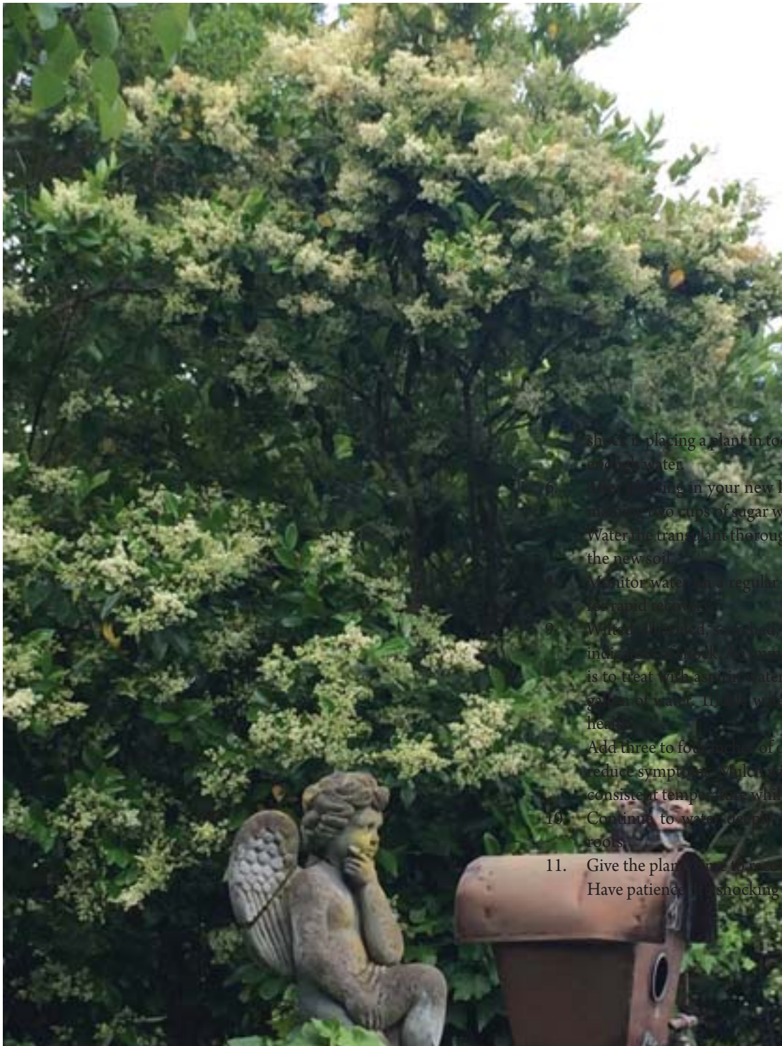
Privet is a fast growing shrub that is used for borders, privacy screens, and in formal gardens.