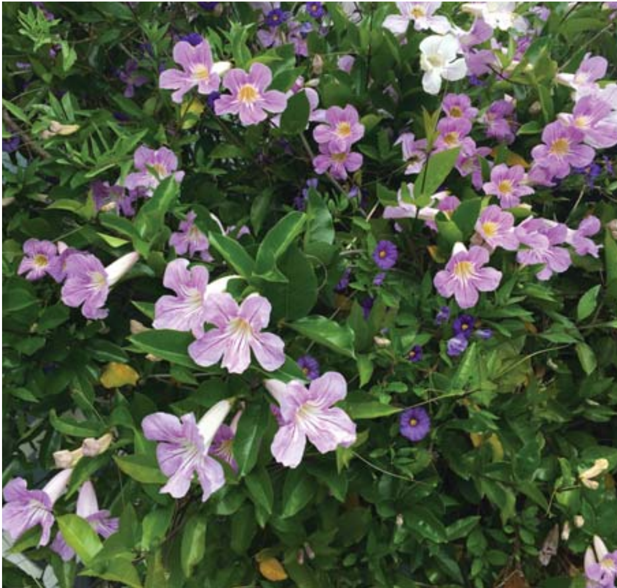
The shiny green leaves of the purple trumpet vine mix perfectly with the deep purple flowers of the potato vine.

"What you plant now, you will harvest later." — Og Mandino