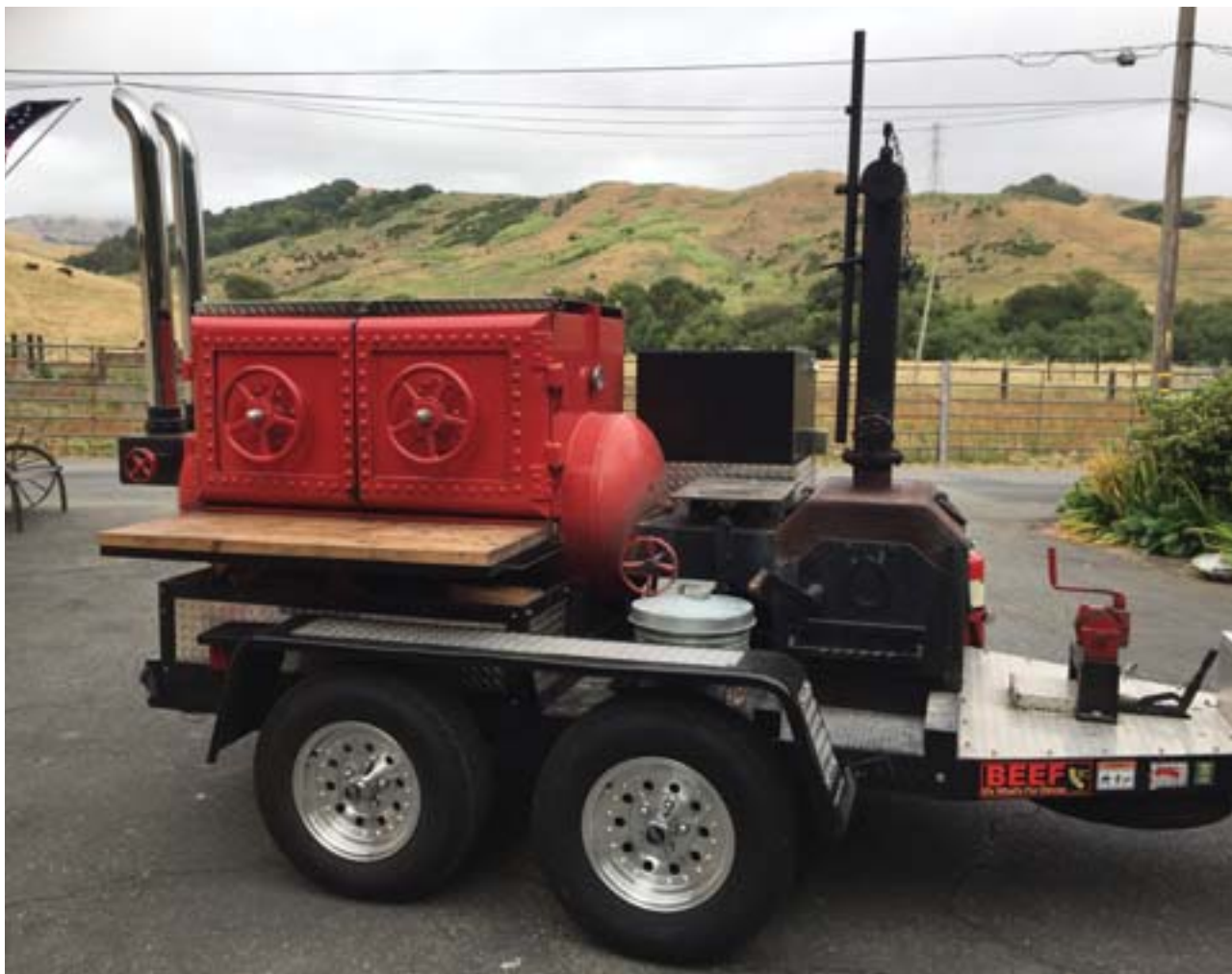
Dan Mazaika's barbecue rig can hold its own against shiny red firetrucks.