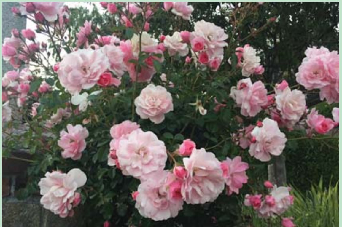
Adding a cascading pink Bonica rose over a mailbox increases curb appeal.