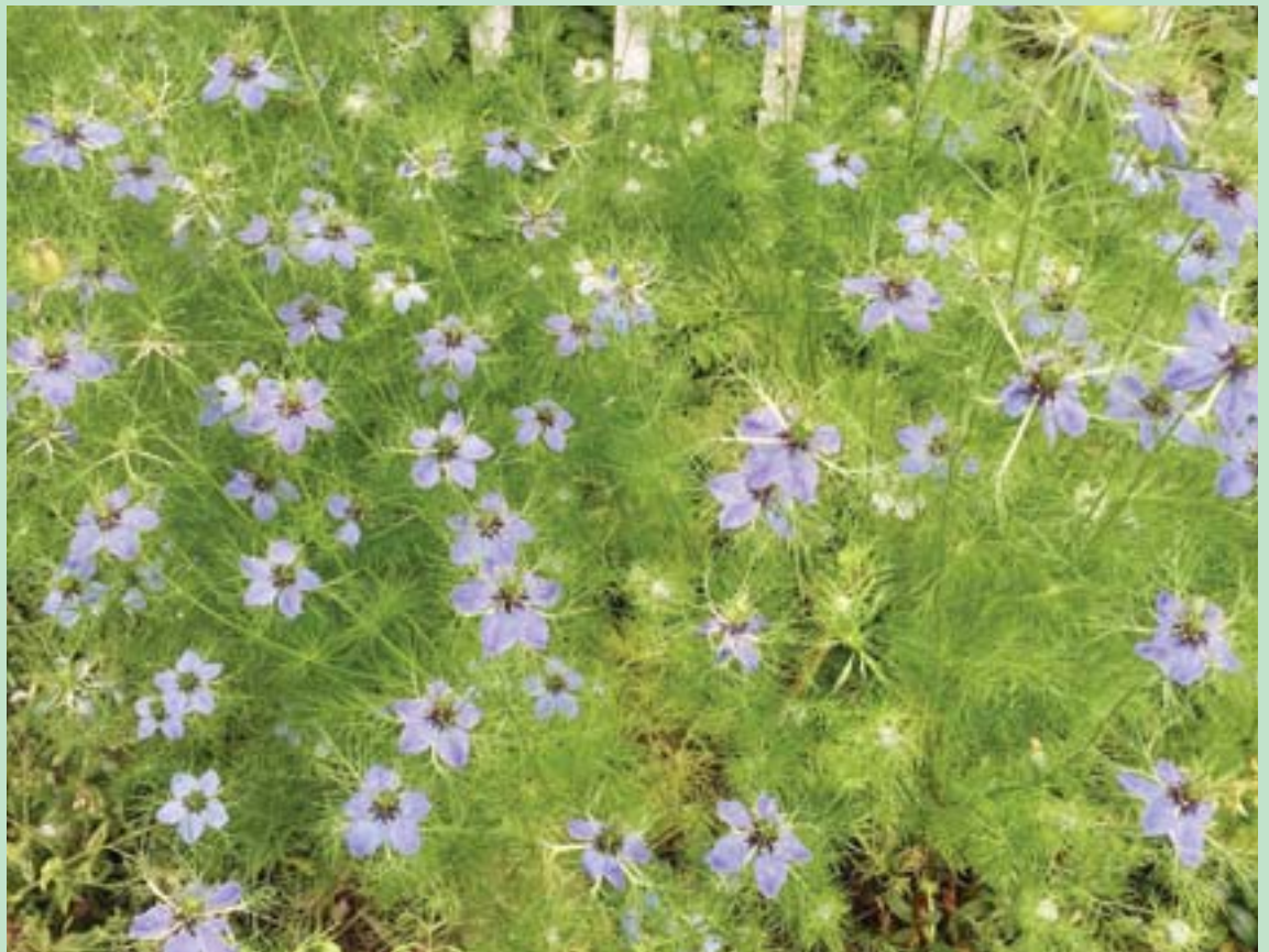
The lacy blue, white, or pink florets of Love in a Mist are great as garden fillers.