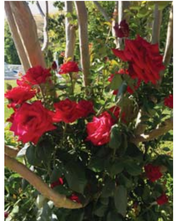
Deep red blooms of the Queen Elizabeth Rose decorate a patio.

Asiatic Lilies increase in blooms annually.