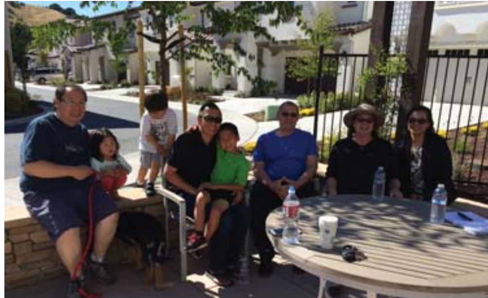
New residents at Via Moraga.