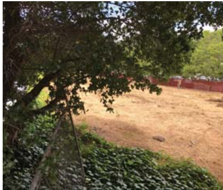
Bella Oaks site at 25A Orinda Way.

Orinda City Council members clearly grappled with their dreams of what Orinda might become as they agreed to a waiver allowing Orangetheory Fitness, an interval training, heartbeat-based fitness center, to anchor a corner of the proposed development at 25A Orinda Way to be known as Bella Oaks.