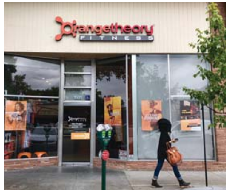
Orangetheory Fitness in Walnut Creek.

The second waiver request presented an even greater challenge to the council, particularly because banks are not open evenings and