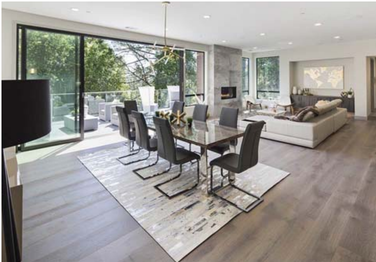
The easy flow, open concept style in this new contemporary Lafayette house is what homebuyers seem to be hoping for.