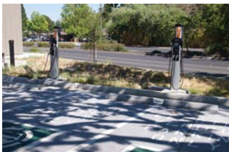
Two new EV charging stations at the intersection of Mt. Diablo Boulevard and Risa Road.

Lafayette electric vehicle drivers have more choice in locations when powering up their green cars now since the city has installed three new ChargePoint stations.