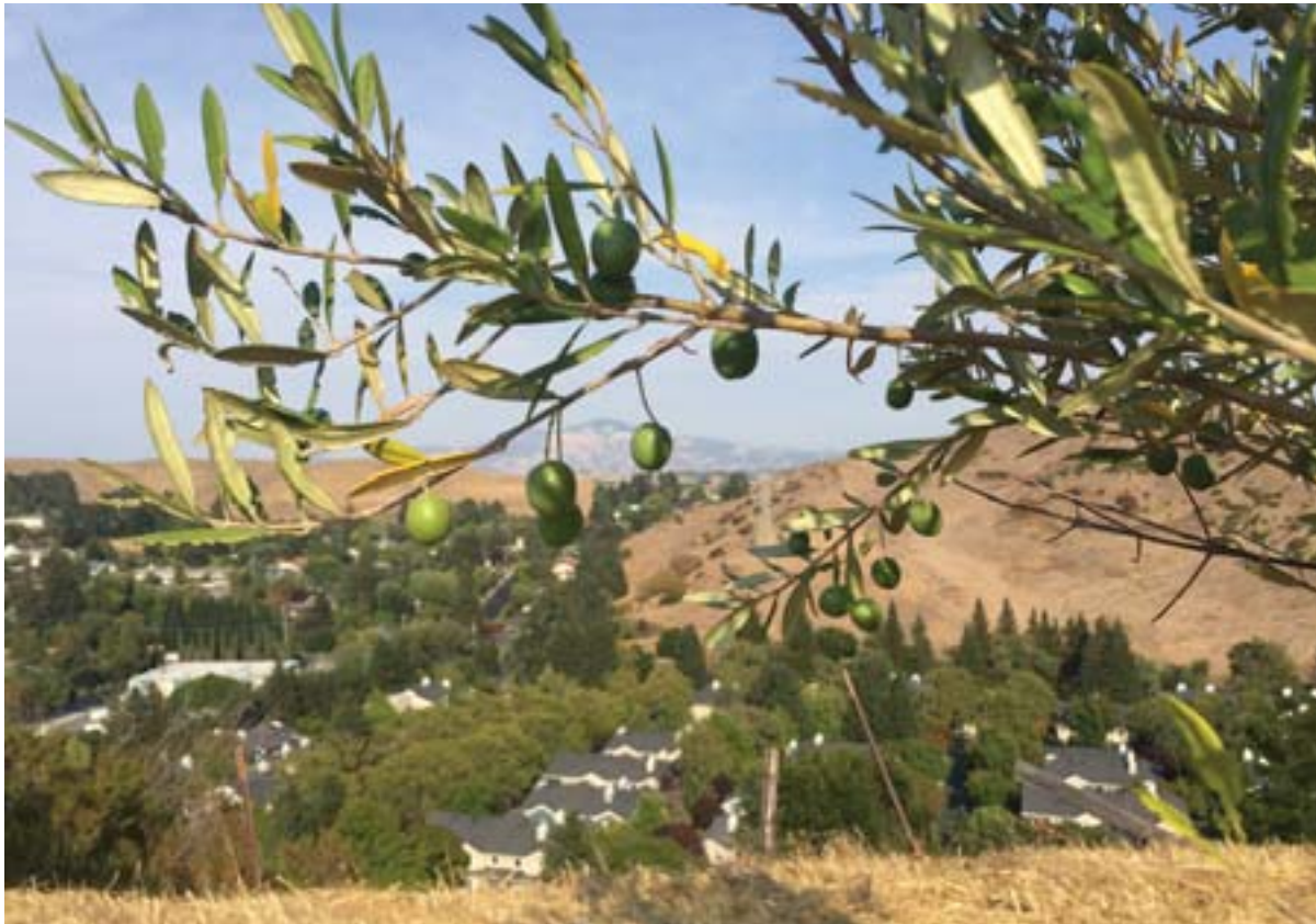
View of Mt. Diablo through the olive tree.

"I went out for a walk and finally concluded to stay out till sundown, for going out, I found, was really going in." John Muir