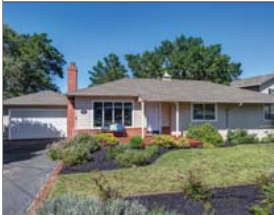
3280 Sweet Drive, Lafayette $1,070,000