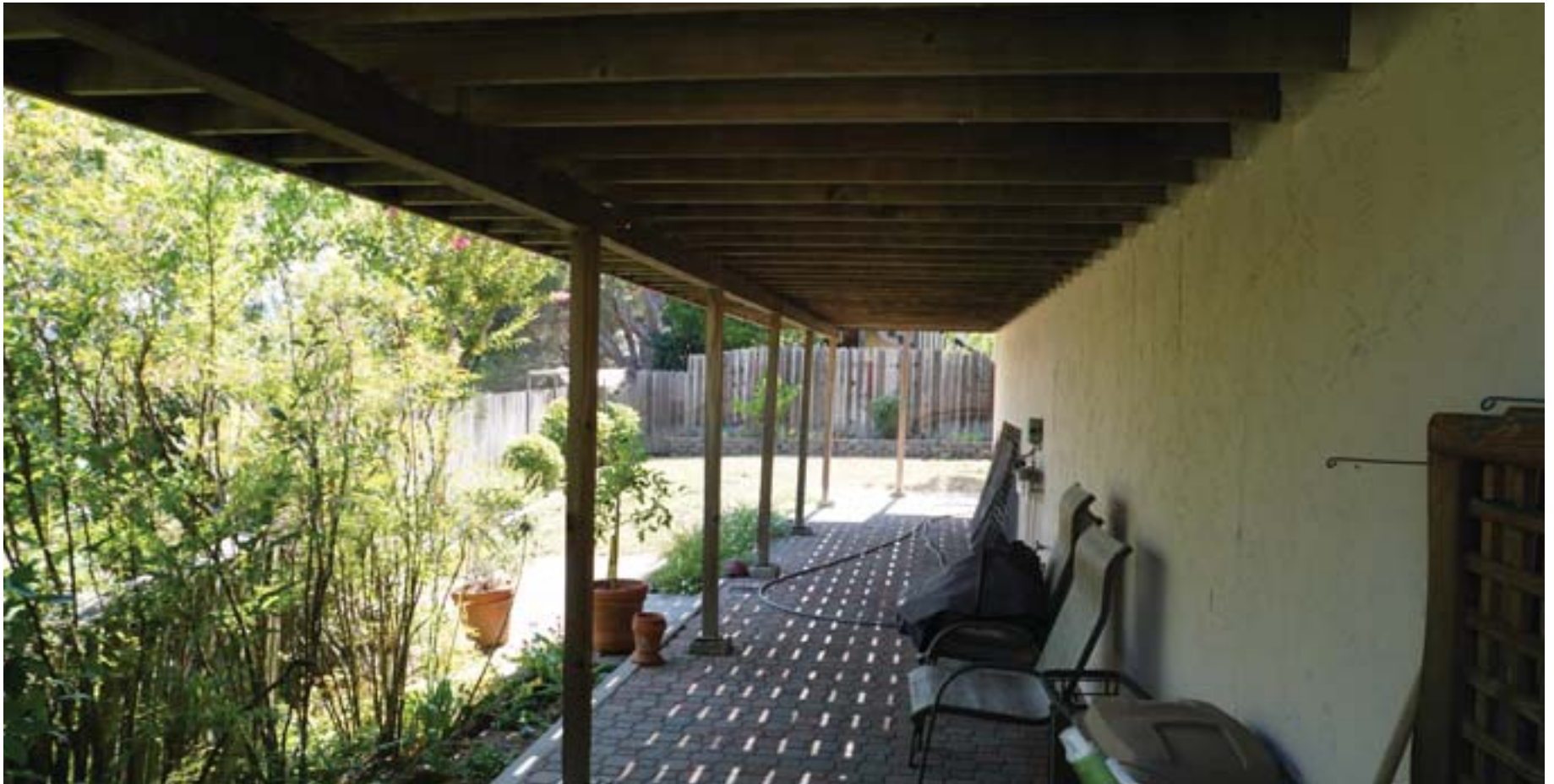
Keep areas surrounding decks free from debris.