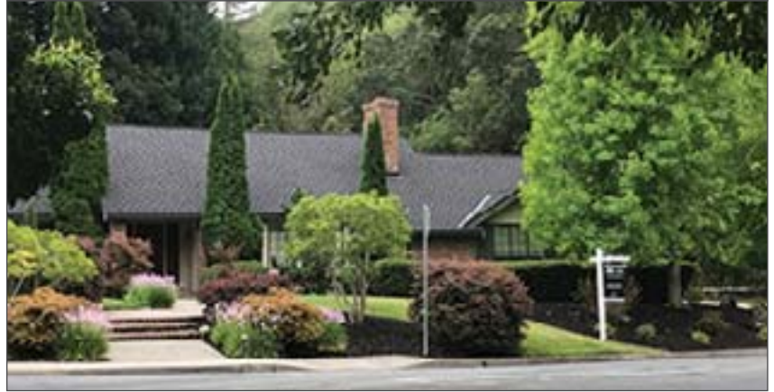
34 Sanders Ranch Road, Moraga Offered at $1,514,000