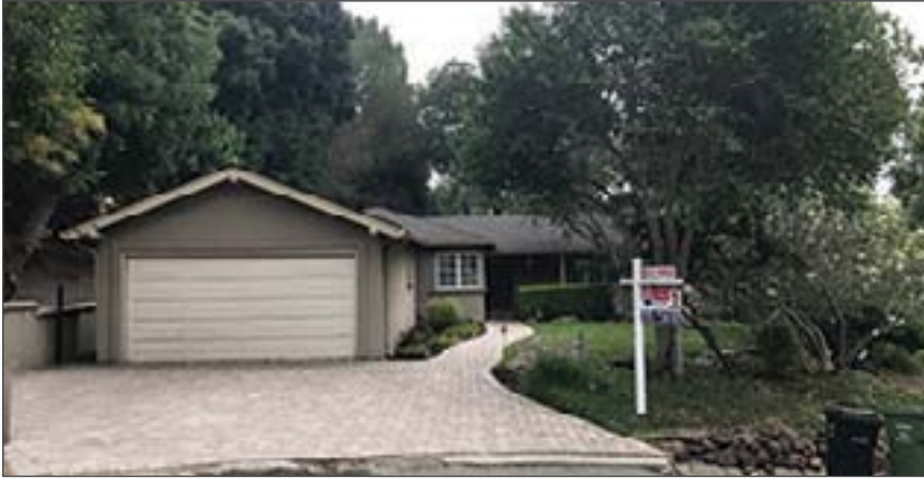
3915 S. Peardale Drive, Lafayette Offered at $1,499,000