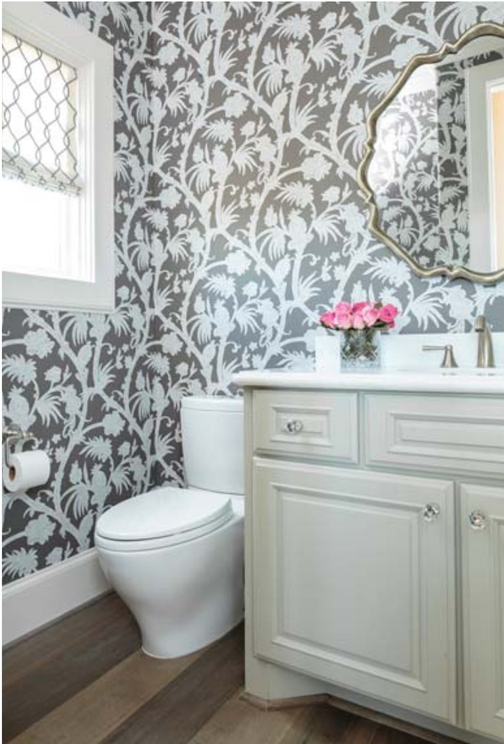
Wallpaper added to this powder room is a wonderful way to add pop.