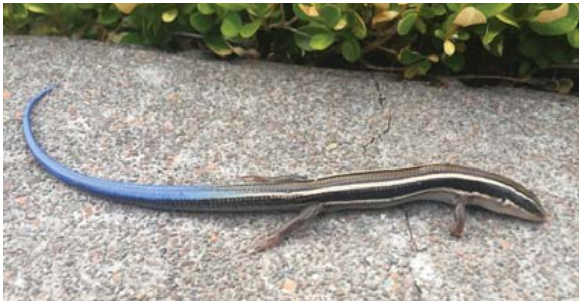
A blue-tailed lizard can regenerate its tail