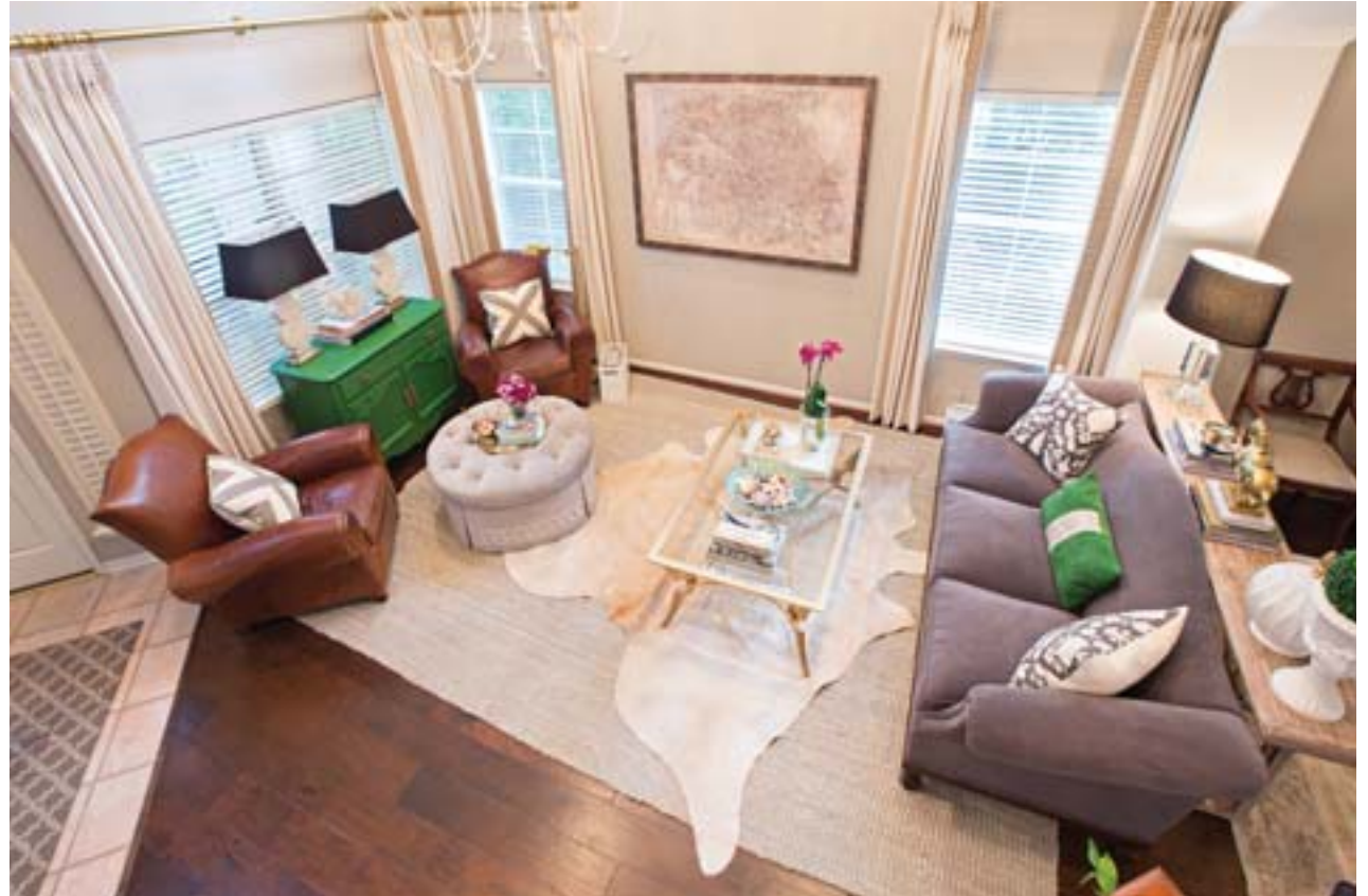
Small pops of color, like this green dresser, pillow and plant, can make a simple elegant statement, while the organic weave in this rug adds texture.