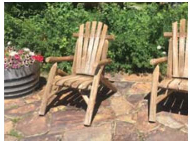
Pull up a chair to watch a September sunset.