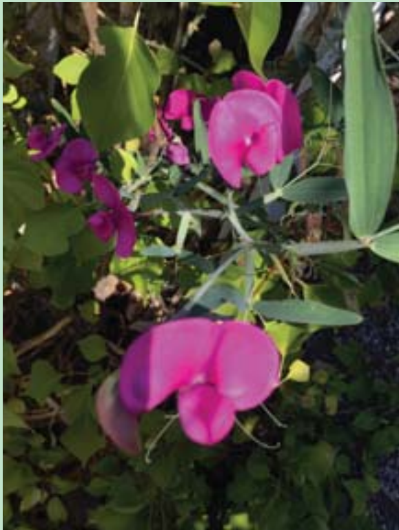
Perennial sweet peas are still adding color to the summer garden.