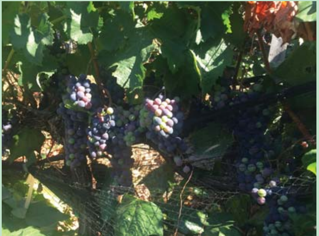
Grapes ripening on the trellis.