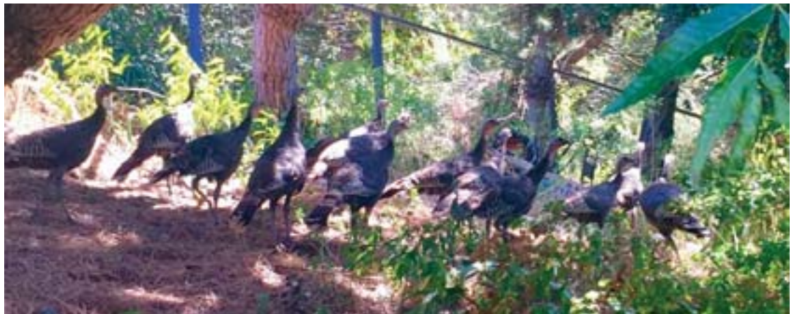
Turkeys trotting across the field.