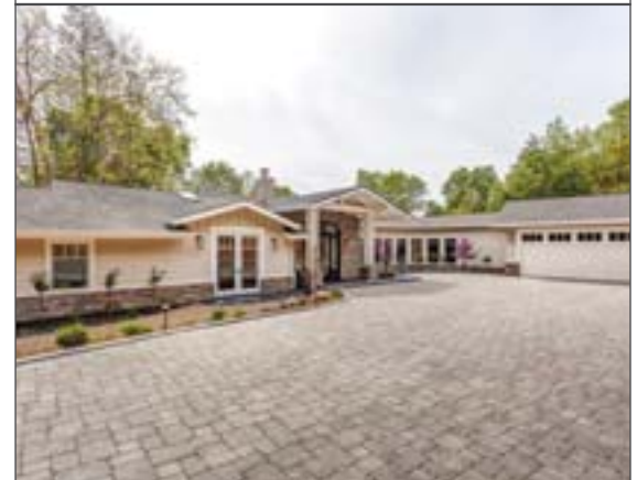
731 Miner Road, Orinda $3,250,000