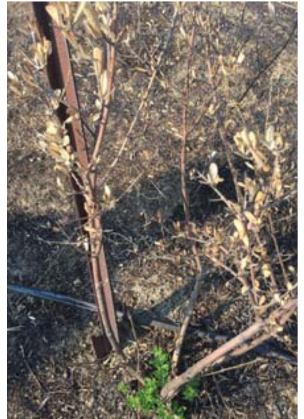
A burned olive tree sprouts again.

It's been extremely enjoyable watching the colorful sunsets from the comfort of my patio chairs. Although I maintain my distance, observing the plethora of wildlife that prance and glide through my own landscape is mes-