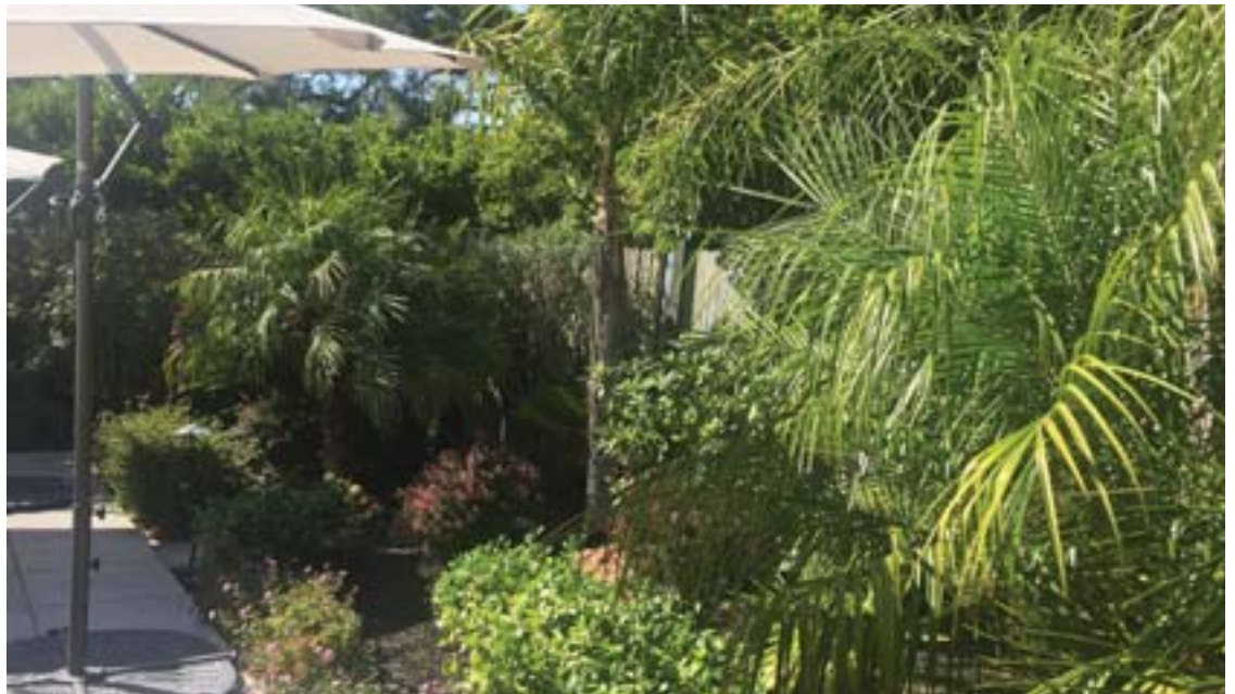
Palms and verdant landscaping are an oasis from the heat.