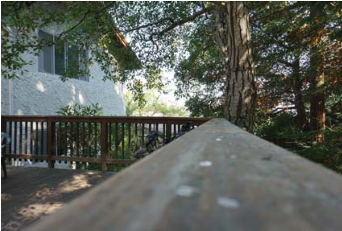
Decks can provide solace and shade, but need TLC during fire season.