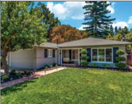
3451 Moraga Blvd., Lafayette $1,295,000