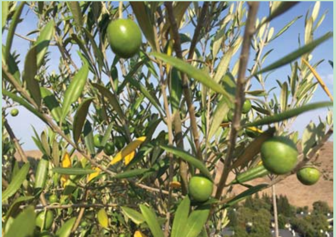
Close-up of green olives.