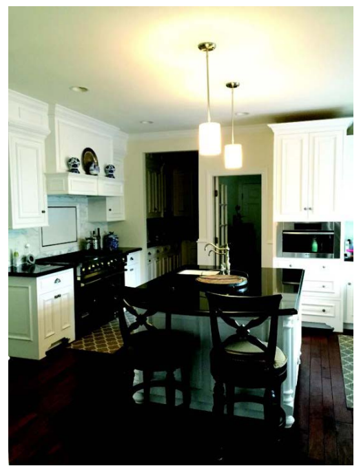
White shows off food best in the kitchen, and the stove cook top in the island or "Commanding Position" bodes well for wealth.

If you feel like creating more space, then keep going. If you do even a few of the tips that I have shared, you might feel inspired to take back control of your kitchen so that this fall you continue to nourish and delight with food to feed the soul of the season.