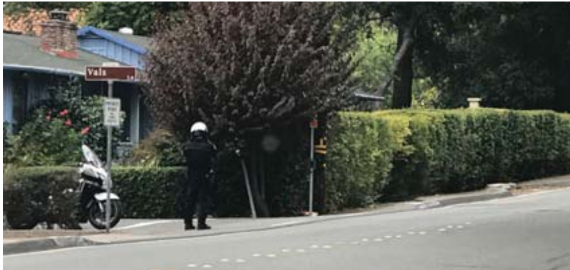
A Lafayette police officer monitors traffic with a radar gun on a straight stretch of Reliez Valley Road where motorists pick up speed.

What to do about the Reliez Valley Road traffic? Either reckless drivers are endangering life by speeding or, during peak rush hours, the road resembles a parking lot and driver tensions run high. City officials continue to ponder the question but push for improvements on the safety issue right now, saying that it is only a question of time until there is a fatality.