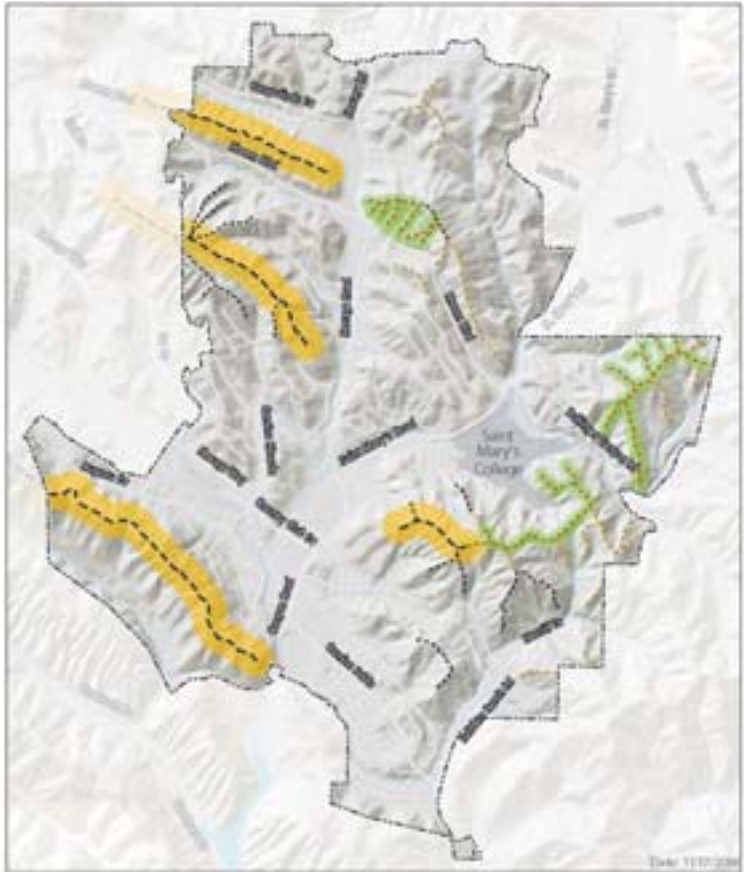
Designated ridgelines figure CD-1 Image provided

Date Source: Team of Moraga, 2013; Contra Costa County, 2013; USGS, 2006, 2013; Planitalks, 2016. MOSO Ridgelines: MOSO Major Ridgelines (dashed black line), MOSO Minor Ridgelines (dotted black line), 500 Foot Buffer for Major MOSO Ridgelines (yellow shaded area). Non-MOSO Ridgelines: Significant Non-MOSO Ridgeline (dashed red line), Other Non-MOSO Ridgeline (dotted red line), 200 Foot Buffer for Significant Non-MOSO Ridgelines (green shaded area). Town Boundary (dashed black line). Scale: 0 to 1 Miles.