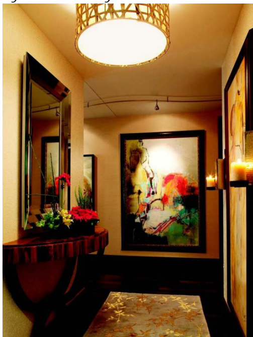
Decorative mirrors symbolize the water element. Photos provided

The nights are long and dark now, with winter's chilly breath whispering frosty remembrances marking the season of stillness. No wonder winter is connected to the water element! The qualities of the winter season and water element are powerfully intertwined, including frozen water turning up as sparkly seasonal snow and ice, or knowing that if you gaze at the surface of a body of water it may appear like not much is going on, but as in winter, life's dormancy often reveals much activity happening beneath the surface.