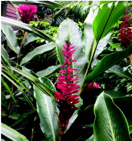
Ginger root comes from the ginger plant.