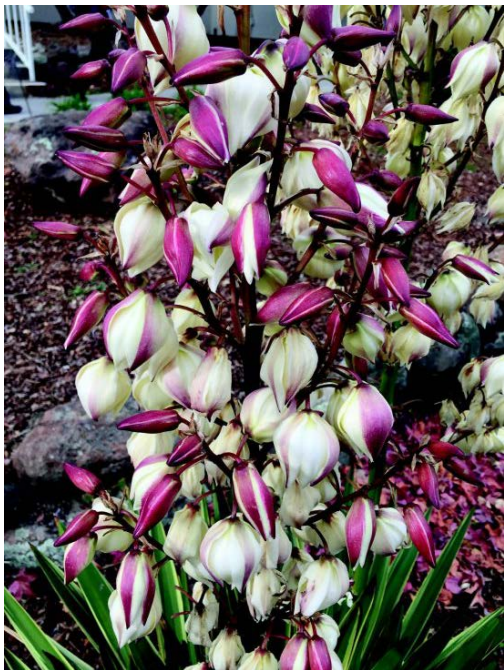
Moundlily yucca. Yucca root is used for a variety of ailments including reducing the pain and swelling from arthritis.