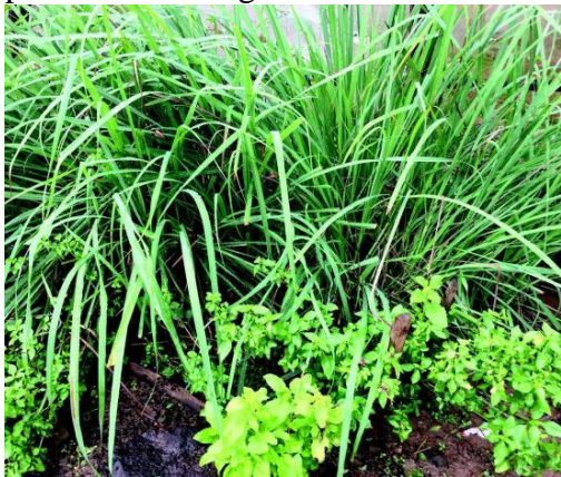
Lemongrass and basil are two herbs that work well together.