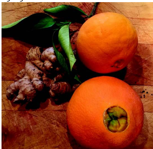
Navel oranges and ginger root.

"Hope and faith flower from the cheerful seeds of the old year to the sprouting garden of the New Year's dawn."