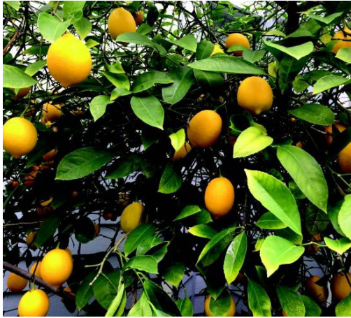
A tree filled with delicious and healing Meyer lemons.