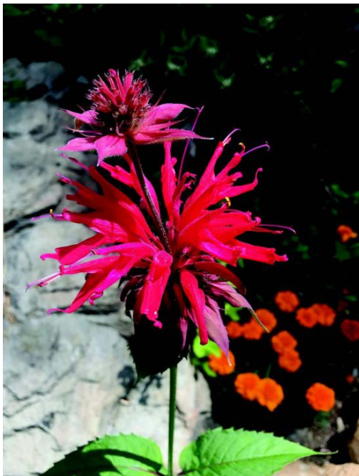
Bee balm can help with cold and flu symptoms.