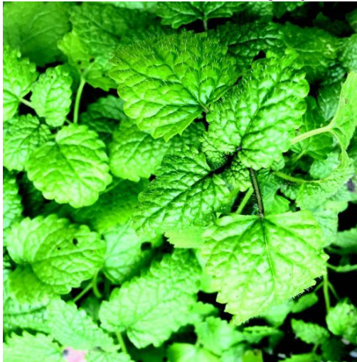
Spearmint will freshen your breath when chewed.