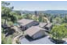
1200 Glen Rd Represented Seller