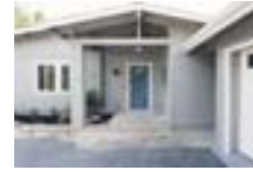
361 Shady Glen Rd Represented Seller