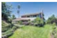
452 Tahos Rd Represented Seller