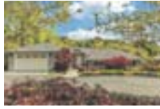
1120 Upper Happy Valley Represented Buyer