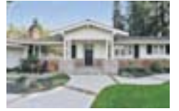
549 Arrowhead Dr Represented Buyer