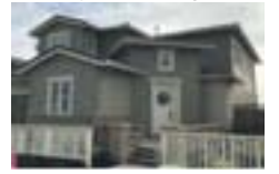
196 Willowbrook Represented Buyer