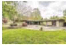
1205 Monticello Rd Represented Seller