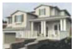
185 Willowbrook Represented Buyer