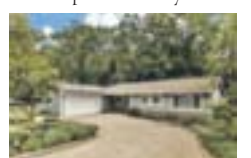
1044 Dolores Dr Represented Buyer