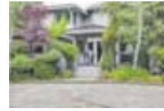
18 Toledo Ct Represented Seller