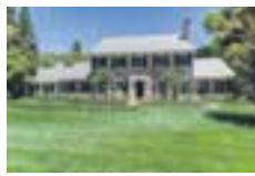
3702 Happy Valley Rd Represented Seller