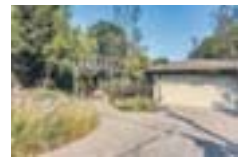
10 Tarry Ln Represented Seller