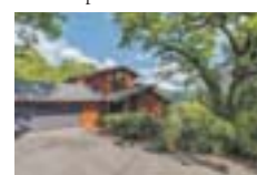
881 Mountain View Dr Represented Seller