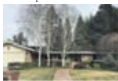
243 Ivy Pl Represented Buyer