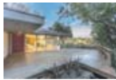
4122 Canyon Rd Represented Seller