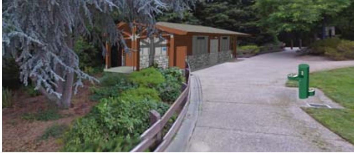
Rendering of the proposed bathroom building

Moraga Community Foundation, the volunteer-led group that raised funds for the surveillance camera police network in Moraga, recently announced its intent to fund a campaign to update the bathrooms located at the Moraga Commons Park next to the recently inaugurated all-access playground to the highest ADA standards. The town council will have to approve the project before the service group starts its campaign.