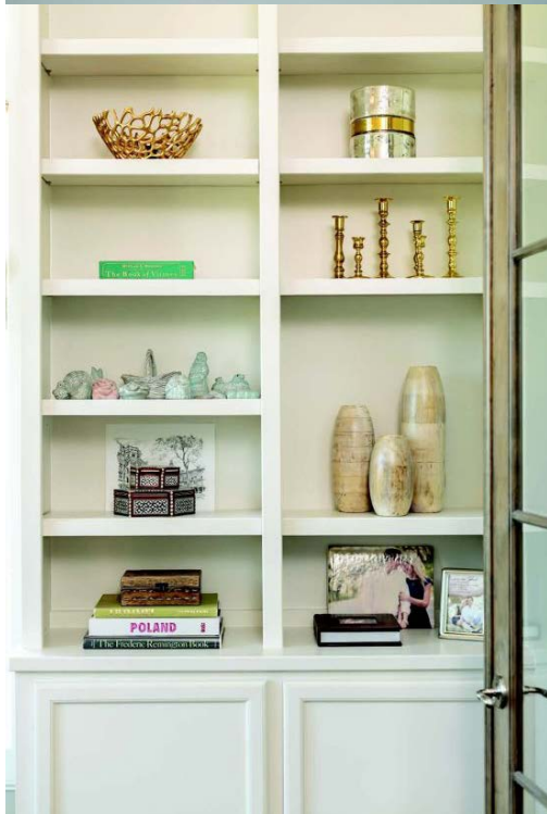
Here we grouped our client's brass candlesticks to create a fun vignette. Photos provided