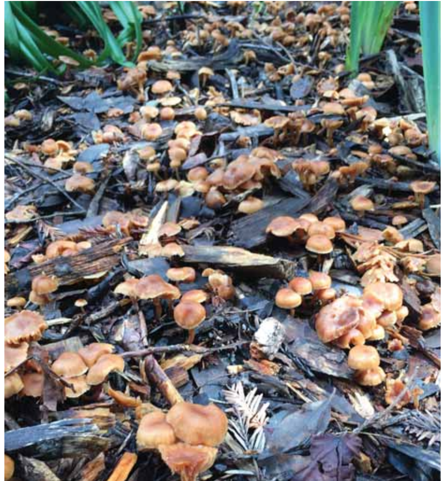
Mushrooms sprouting everywhere. Beware!

Since the rain and hail we experienced in March, weeds are ubiquitous. Before seeding, weeding is essential. If you like to be adventurous while consuming a nutrition-