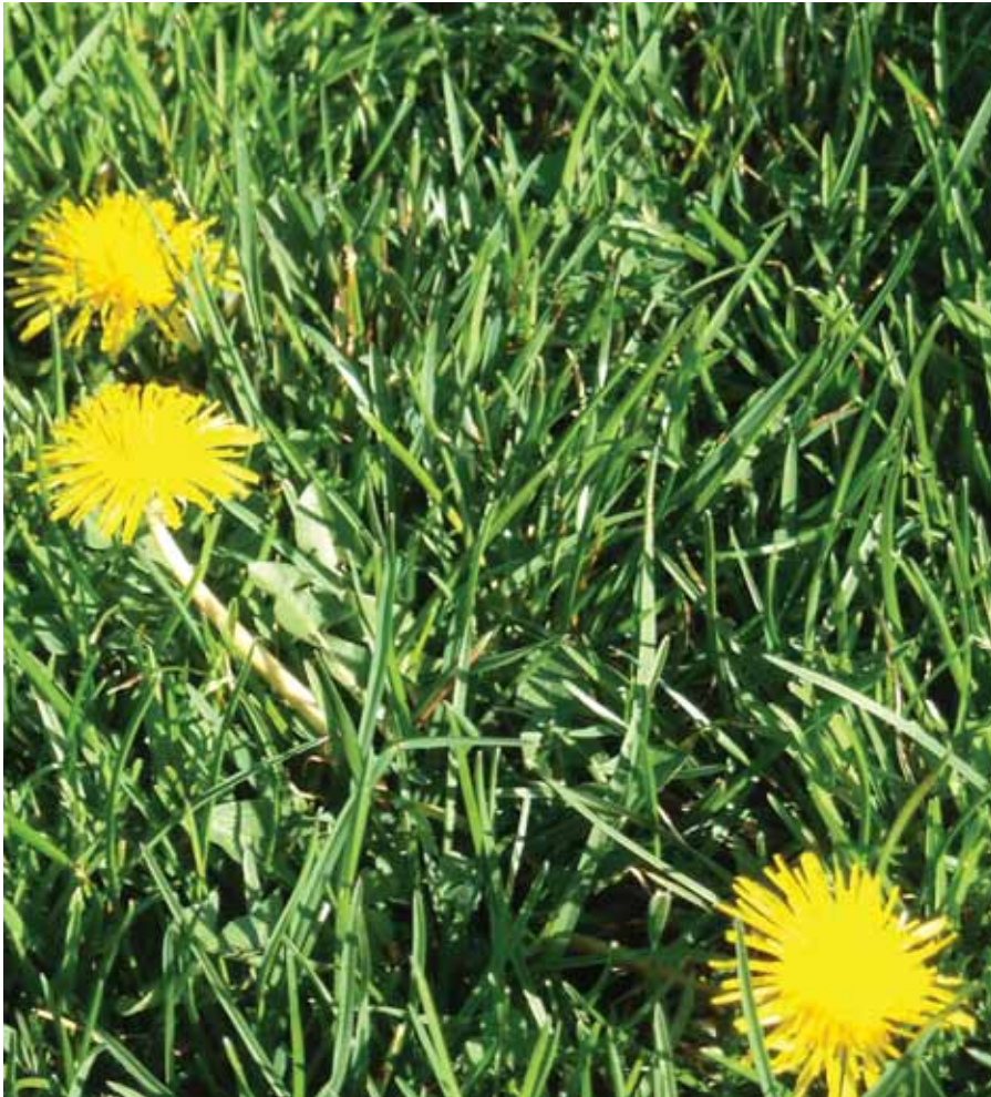
Dandelions in grass

"Nothing is so beautiful as spring when weeds, in wheels, shoot long, and lovely, and lush ..." – Gerard Manley Hopkins