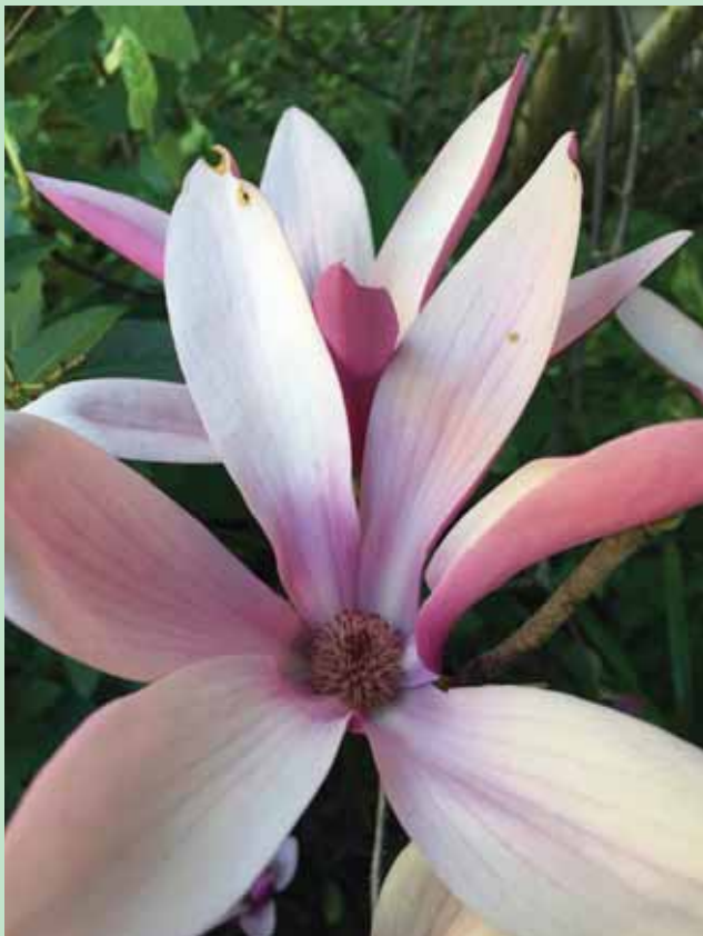
Close up of a tulip magnolia flower.