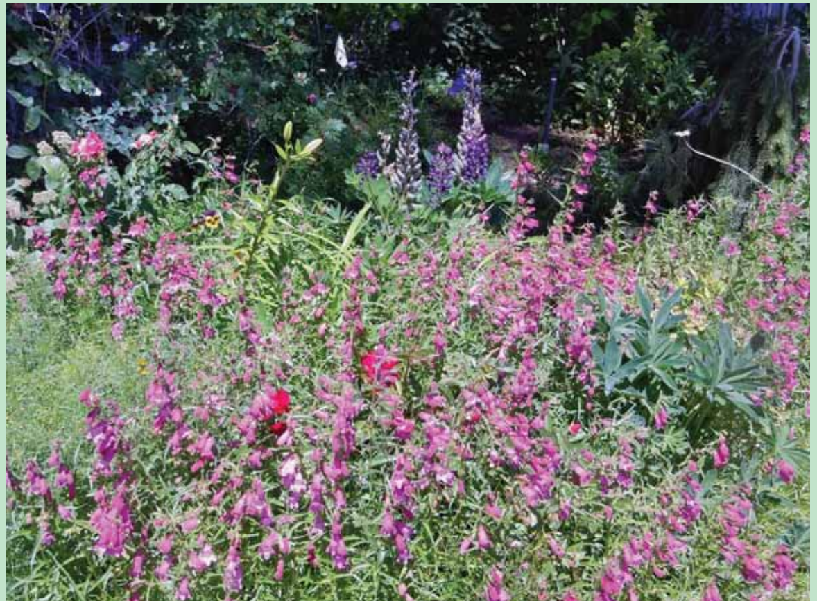
Penstemon seeds can be scattered in a sunny location to attract hummingbirds.