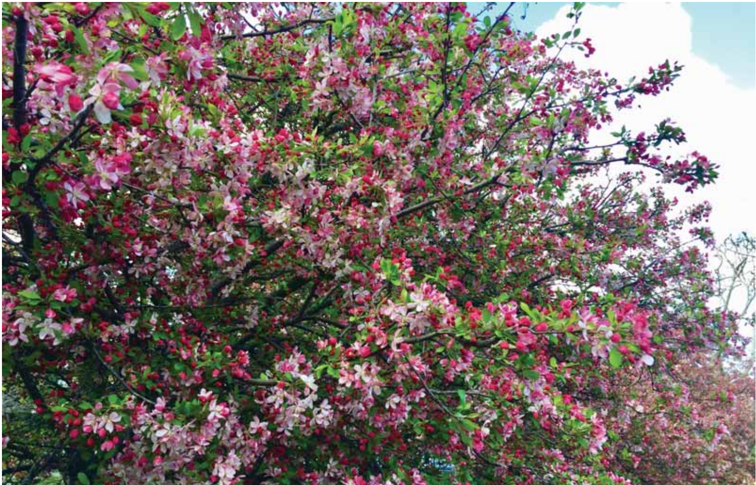
Crabapple tree in full bloom

If you are planting on a porch, be mindful of frosty evenings where you'll need to provide heat. Speed seed germination with a heat mat that you place under trays or containers and remove the heat mat once the seeds have sprouted.