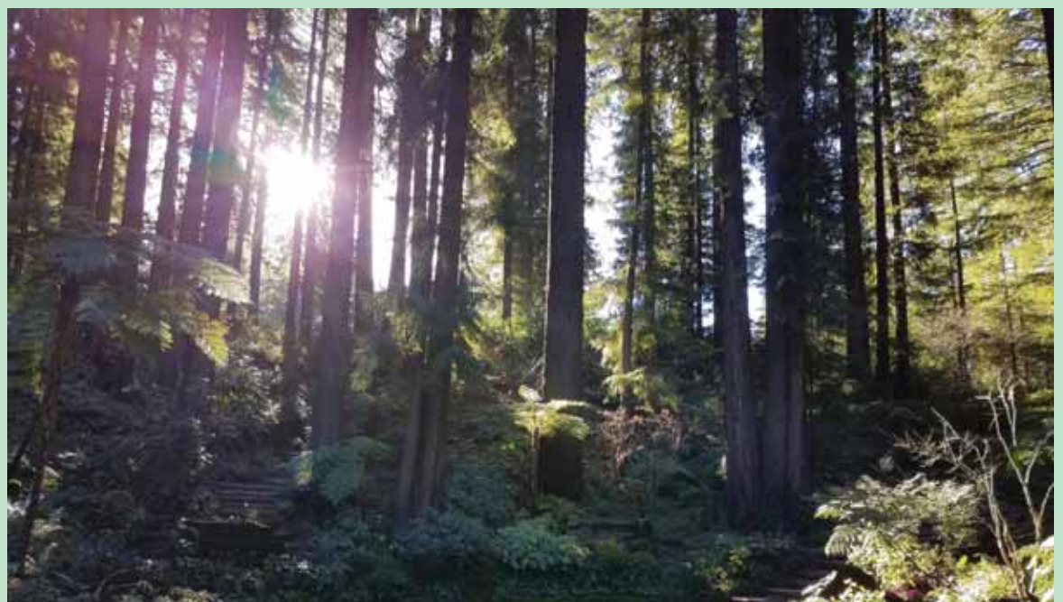
Walk in a forest or hug a tree to get your dose of forest bathing or shinrin-yoku