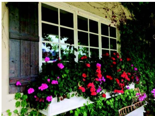
Geranium-filled window boxes Photos provided

The Lafayette Garden Club will host its Artful Gardens Tour over Mother's Day weekend on Saturday May 12, from 10 a.m. to 3 p.m. The self-guided tour will explore five magnificent Lamorinda gardens at the height of their spring glory, plus offer a pop-up market and plant sale.