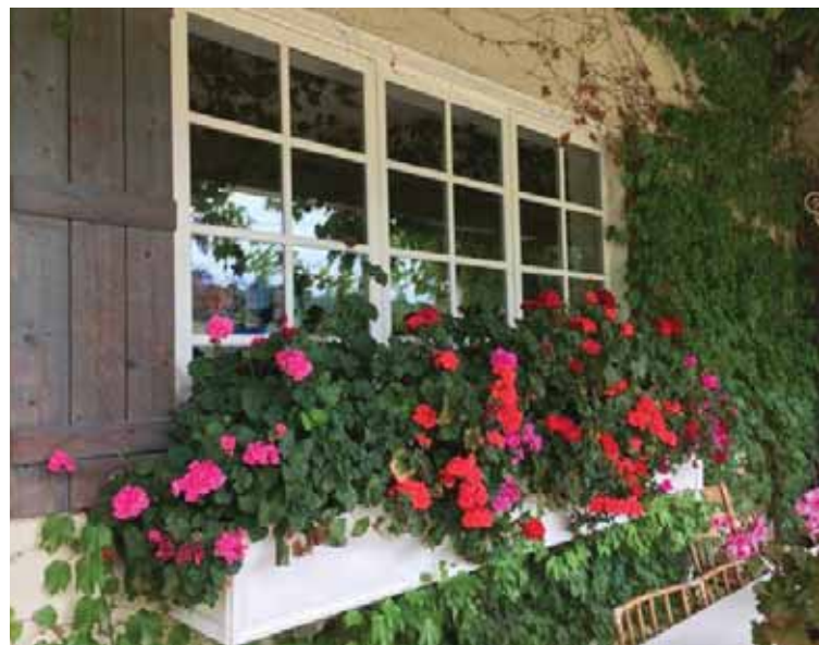
Geranium-filled window boxes