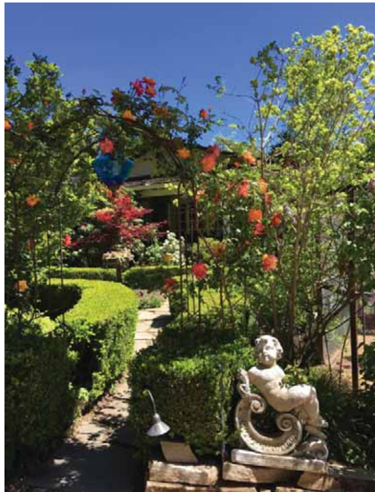
Roses climb this antique arbor

Help a Foster Child Get Back to Being a Kid.