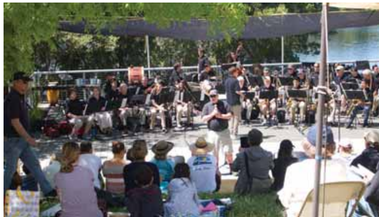
Last year's concert