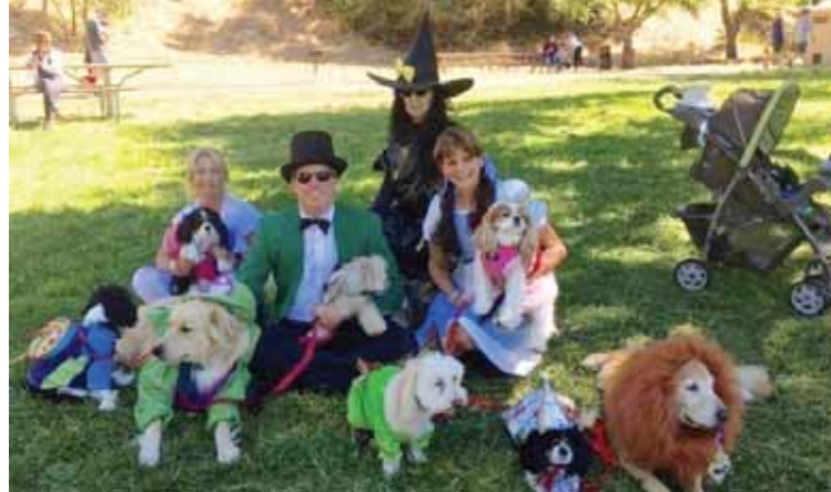
Dorothy and the Wizard of Dogs from Diablo Ballet’s Paws de Tutu dog competition at Lafayette Reservoir.

Saturday, June 23 will be a day that goes to the dogs ... dogs in costume, that is. From 9-11 a.m., Diablo Ballet will host its third annual PAWS de Tutu, a fun-filled event at the Lafayette Reservoir, complete with a dog costume “com(paw) titution,” entertainment, celebrities, snacks and prizes. There will be demonstrations by the Contra Costa Sheriff’s K-9 Unit, as well as doggie yoga and dog training; there will also be a performance by STARS 2000 Teen Theater’s cast of “Legally Blonde, the Musical,” with special guest, Bruiser, the Chihuahua.