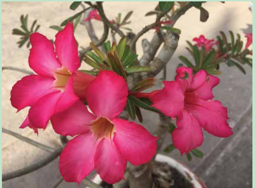
Adenium desert rose features bright red pink blossoms. Stems are poisonous.