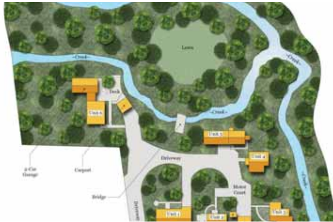
Sold 3182-A Acalanes Avenue List Price $1,650,000 Sold Price $1,825,000