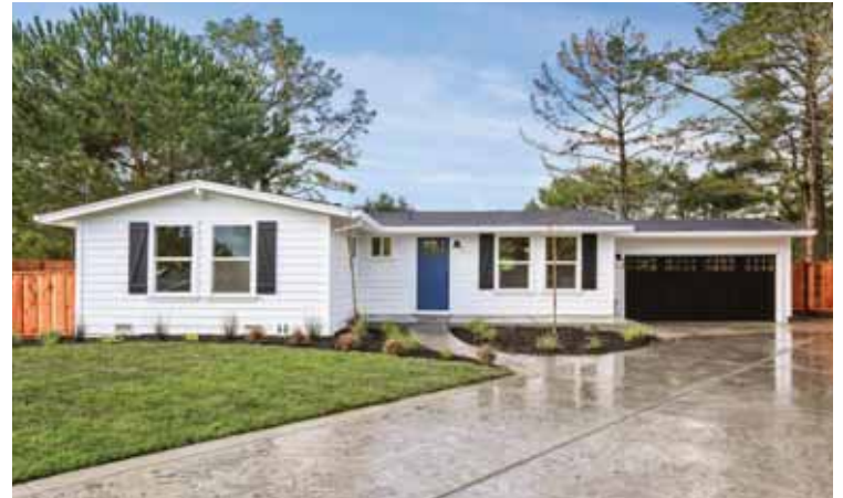
Sold 3363 Betty Lane List Price $1,525,000 Sold Price $1,630,000