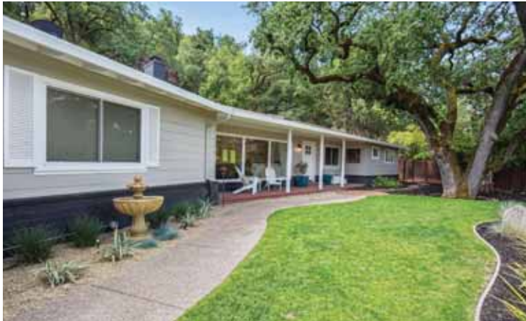
Sold 3765 Highland Road List Price $1,285,000 Sold Price $1,500,000

Records broken in 2 neighborhoods this year. We can get you the highest price per square foot in your neighborhood with our home preparation system. Call us for details.