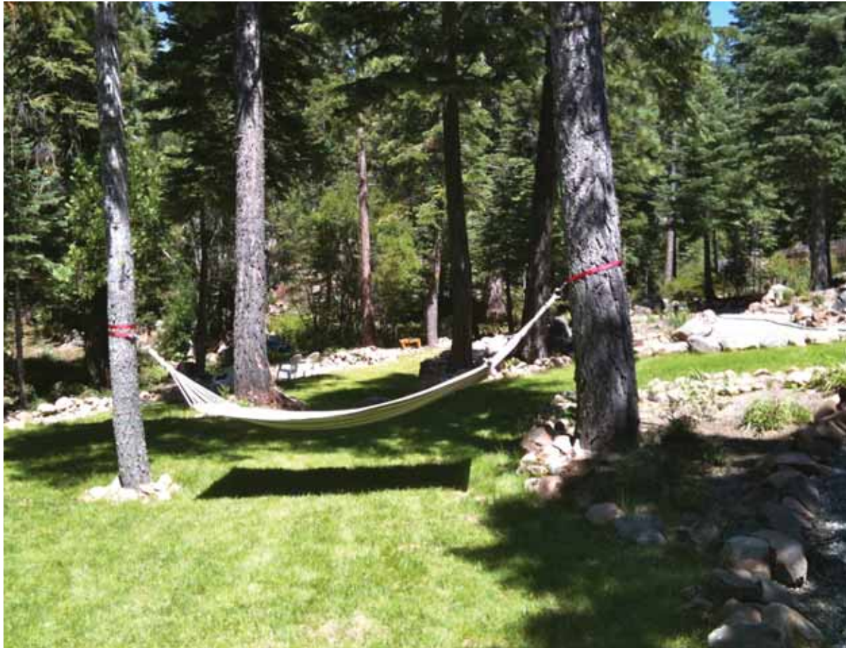
Tying a hammock between trees offers a place to relax.

"Though we travel the world over to find the beautiful, we must carry it with us or we find it not." ~ Ralph Waldo Emerson