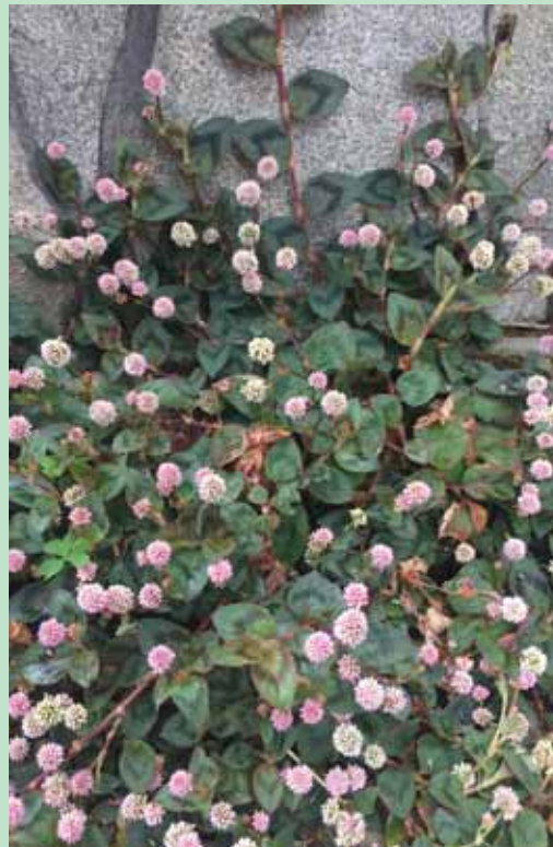
Lamium pink pom pom grows in cracks in a rock wall.