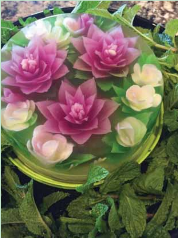
A floral salad made with Jell-O is a refreshing summer treat.