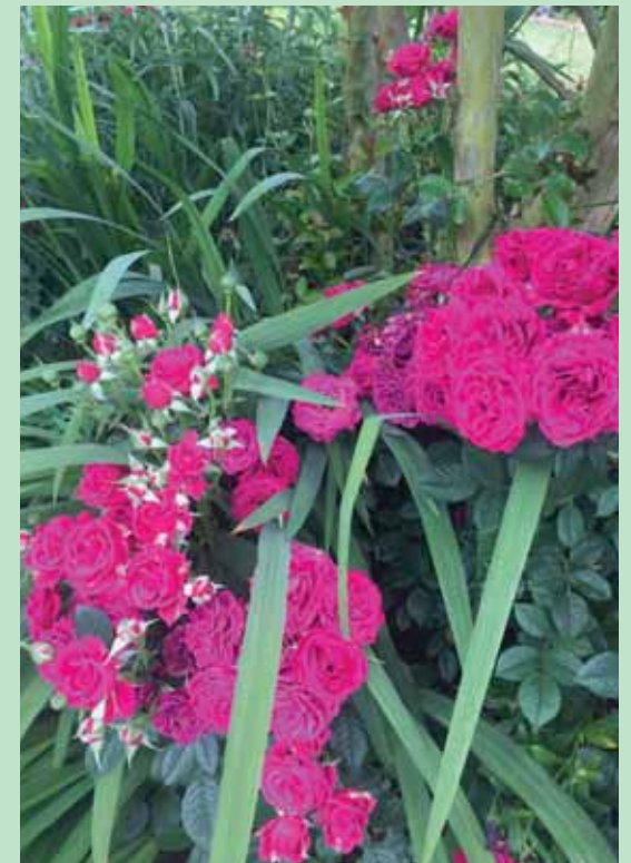
Miniature roses grow amongst the sage.