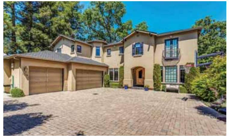
Sold 129 Jordan Place List Price $1,875,000 Sold Price $1,900,000