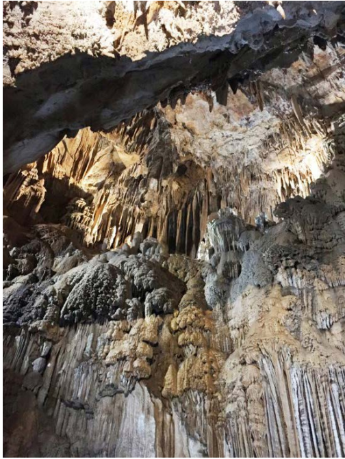
Lake Shasta Caverns

Reach the reporter at: info@lamorindaweekly.com