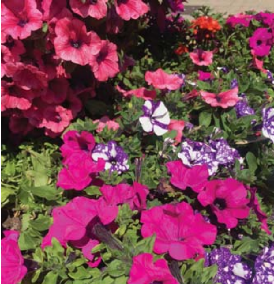
Petunias, petunias, petunias - the favorite summer flower.

"A man travels the world over in search of what he needs and returns home to find it." ~ George Moore