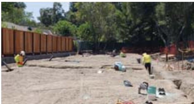
Workers prepare fire station pad for underground utilities in this late July photo. Retaining wall is at left.