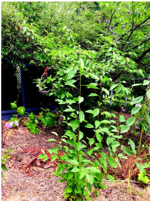
Cut back root suckers that develop on trees.