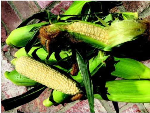
Fresh picked corn to be shucked.