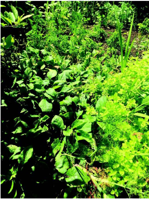
Cut, dry, or freeze your over abundance of herbs to use this winter.