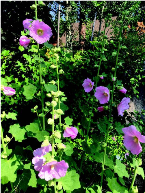
Summer is for hollyhocks ... pretty in pink.