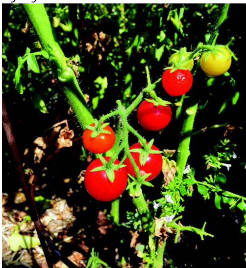
Plucking red cherry tomatoes straight from the vine.

"Plough thorough and deep, while sluggards sleep, and you shall have corn to sell or to keep" - Poor Richard