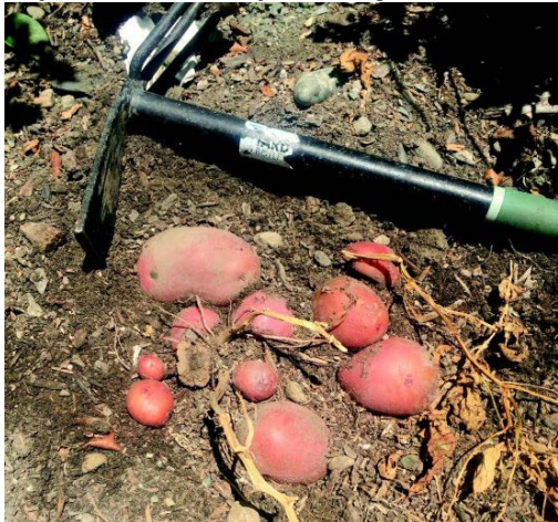
Once potato leaves die back, it's time to start digging.