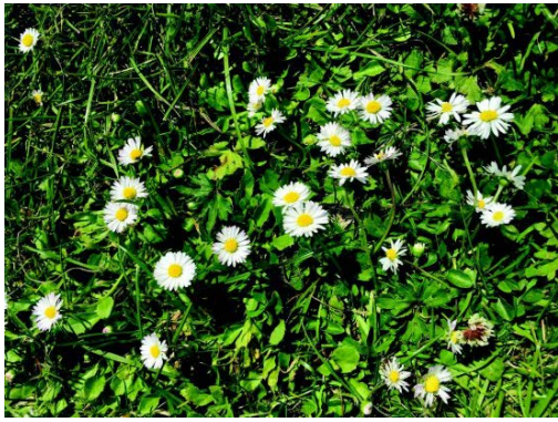
Tiny daisies could be eye-catching in a lawn.