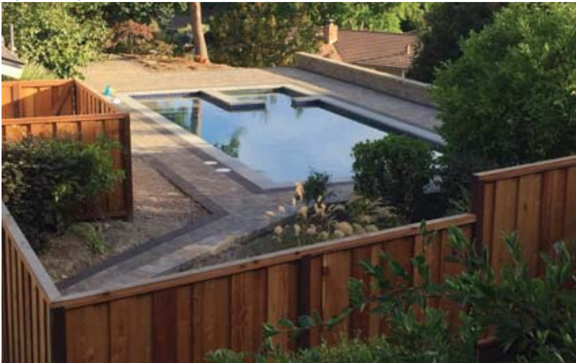
Dive in! This finished 15-foot by 35-foot backyard inground pool is ready for use.