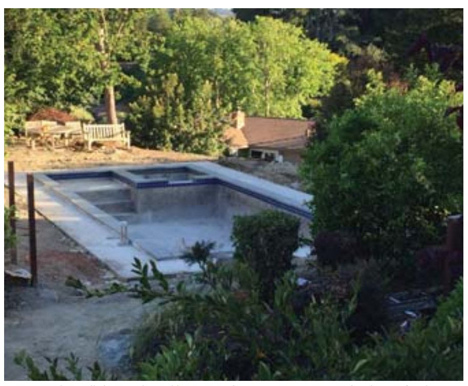
Decorative tile installed; Pennsylvania blue stone used as coping stone is mortared to the top of pool.