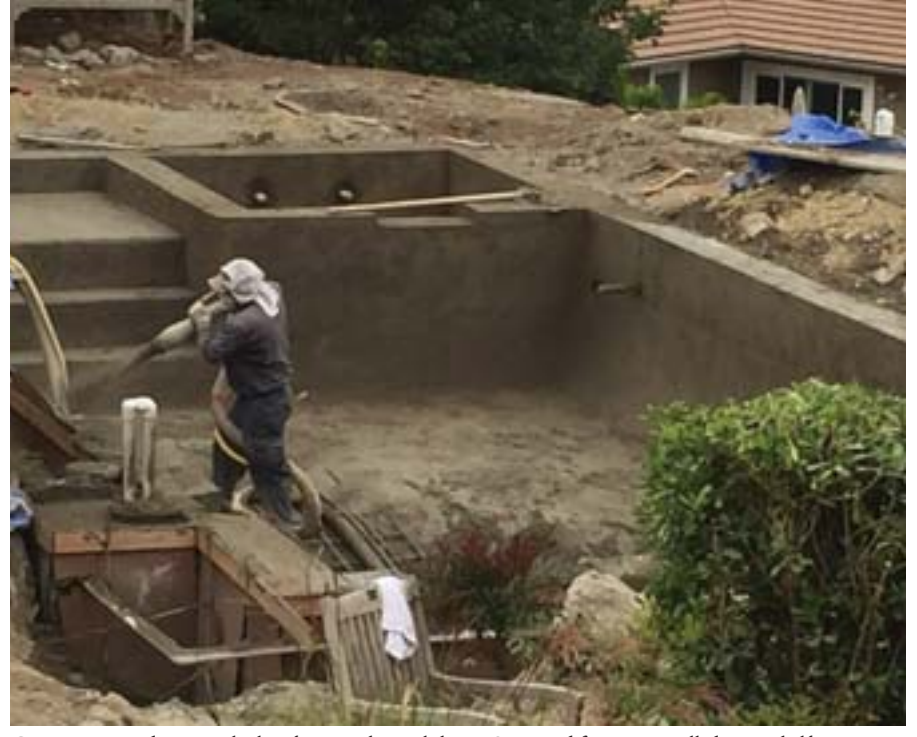
Gunite is sprayed over steel rebar forming the pool shape. Oversized first step is called a sun shelf.