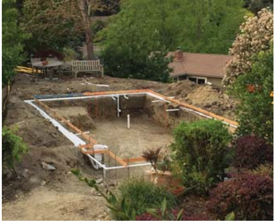
Pool dug to 6.5-foot depth; circulation pipes installed.