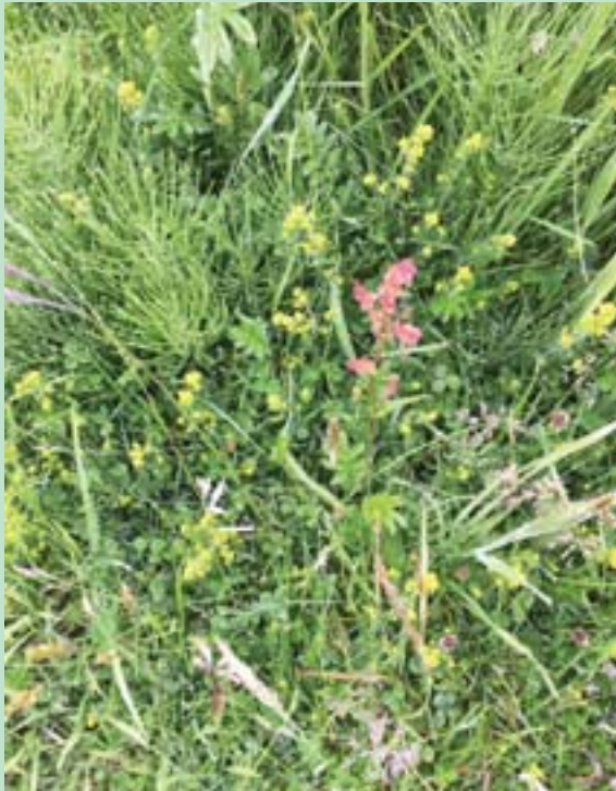
A variety of tiny blooms, including clover.