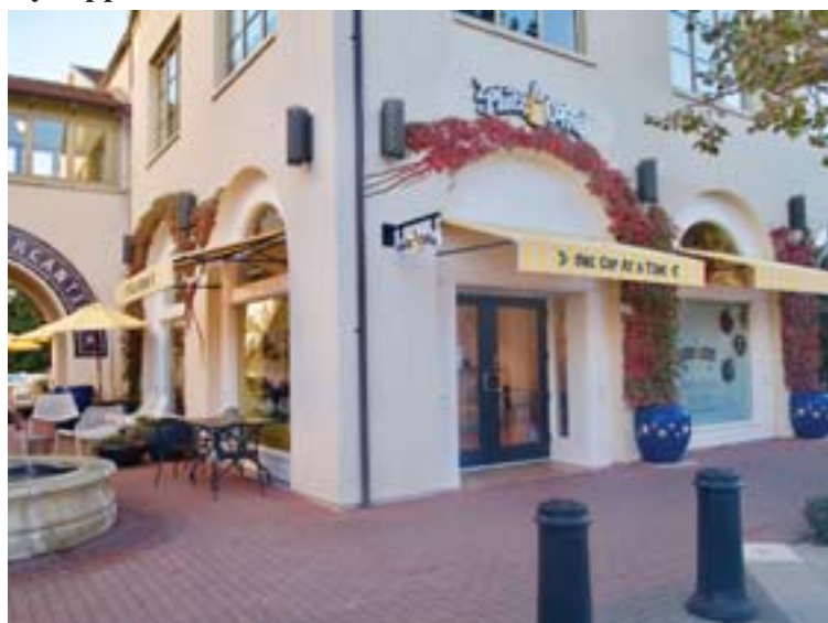
Philz is scheduled to open its new Lafayette store Nov. 19 in the Mercantile shopping center.

The signs are up, the tables are in and very soon residents will wake up and smell the coffee ... at the new Philz Coffee shop in Lafayette.