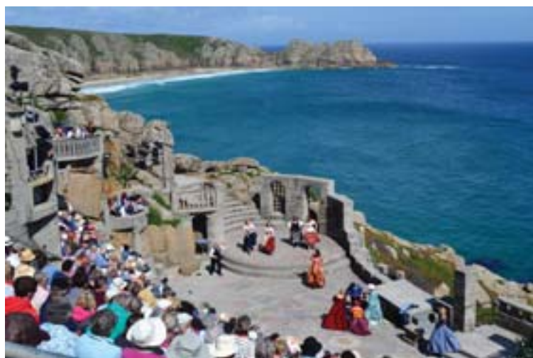
The Minack Theatre sits on the cliffs high above the Atlantic Ocean.

Life's bizarre twists and turns occasionally change lives. So it was for the manager of a Lafayette shop, who found herself back in the country of her birth, having called the East Bay her home for 27 years.