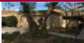
1980/82 Oak Grove Rd, WC