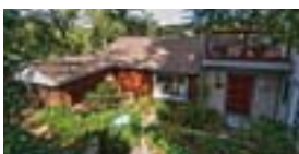
39 Barbara Rd, Orinda