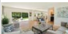
1013 Windsor Dr, Lafayette