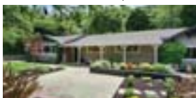
1 Poco Paseo, Orinda