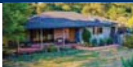
88 Davis Rd, Orinda