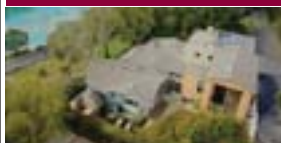
19 Dos Posos, Orinda