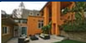
19 Dos Posos, Orinda