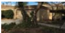
1980/82 Oak Grove Rd, WC