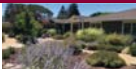
113 Estates Dr, Orinda