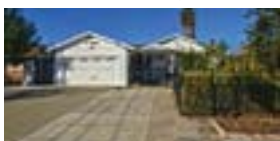
2121 Risdon Rd, Concord