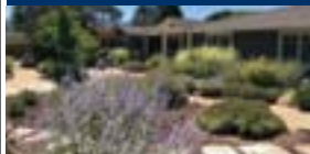
113 Estates Dr, Orinda