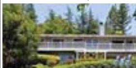
24 Camino Sobrante, Orinda