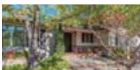
15 Parkway Ct, Orinda