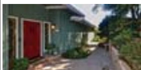
69 Barbara Rd, Orinda