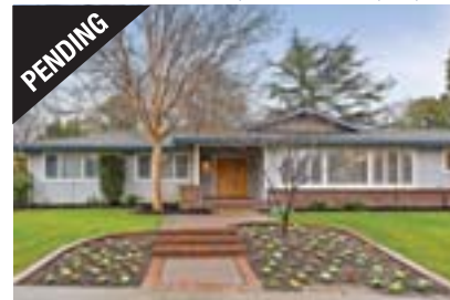
ZOCCHI & ASSOCIATES 925.360.8662