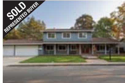
HURLBUT TEAM 925.383.5500