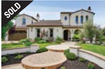
ZOCCHI & ASSOCIATES 925.360.8662