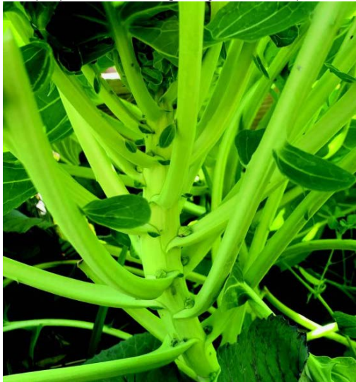
Check out the small buds growing in the axils of a stalk of Brussels sprouts!