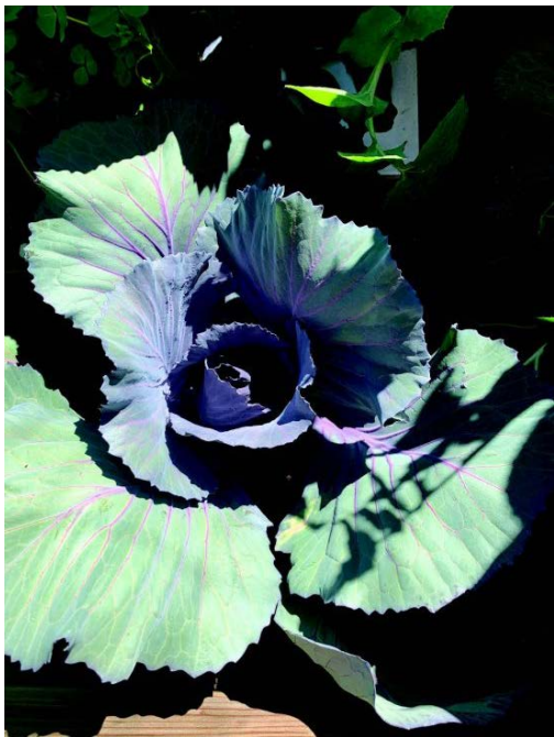
Add purple head cabbage to your diet to prevent premature aging.