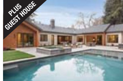
26 N. JACKSON WAY, ALAMO $3,490,000