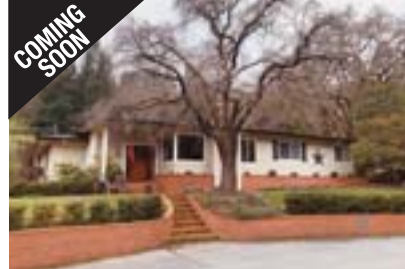
3337 WALNUT LANE, LAFAYETTE CALL FOR PRICE