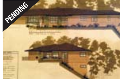
36 TARRY LANE, ORINDA CALL AGENT