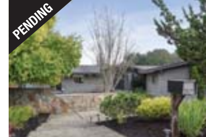
3875 QUAIL RIDGE RD., LAFAYETTE $1,895,000