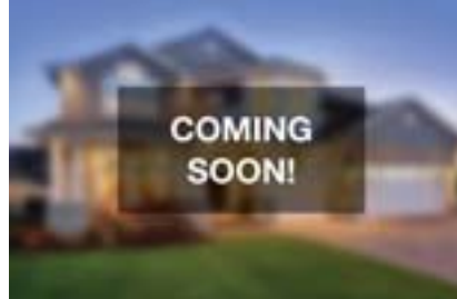
DOWNTOWN LAFAYETTE CALL FOR PRICE