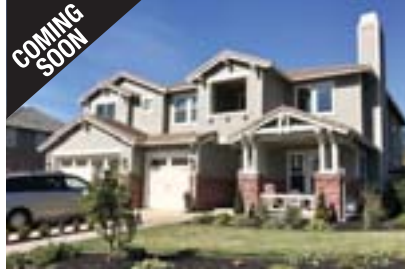
1 TYLER COURT, DANVILLE CALL FOR PRICE