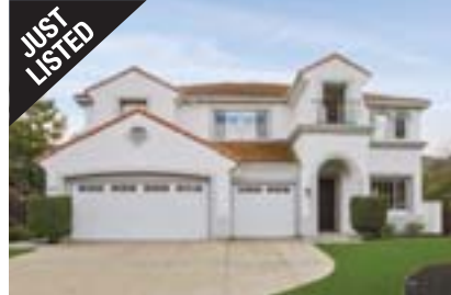
1000 ROLLING WOODS WAY, CONCORD $1,035,988