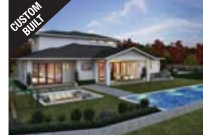
66 CREST AVENUE, ALAMO CALL FOR PRICE