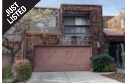
1920 ASPENRIDGE COURT, W.C. $850,000