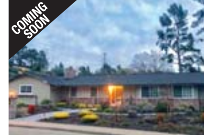
CAMINO RICARDO, MORAGA CALL FOR PRICE