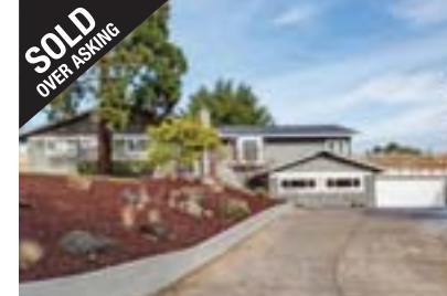
207 ACACIA LANE, ALAMO $1,755,000