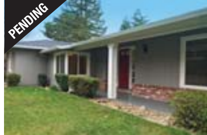
1084 UPPER HAPPY VALLEY ROAD $1,529,000