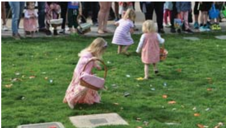
Picking candy off the ground