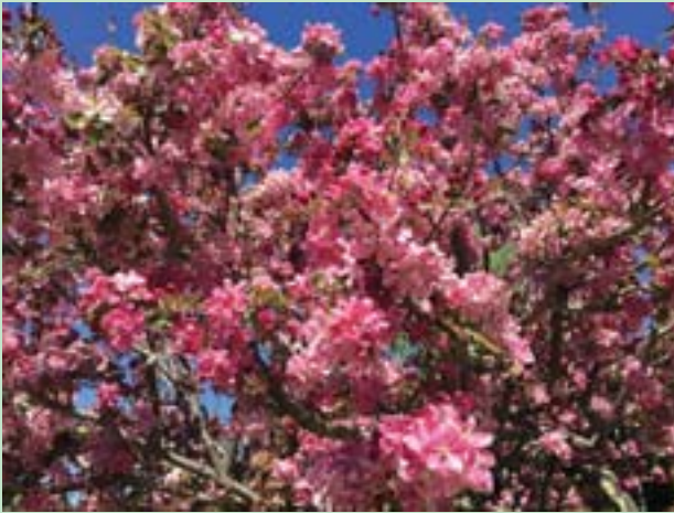
Crabapple trees are a good specimen choice for fire resistance.