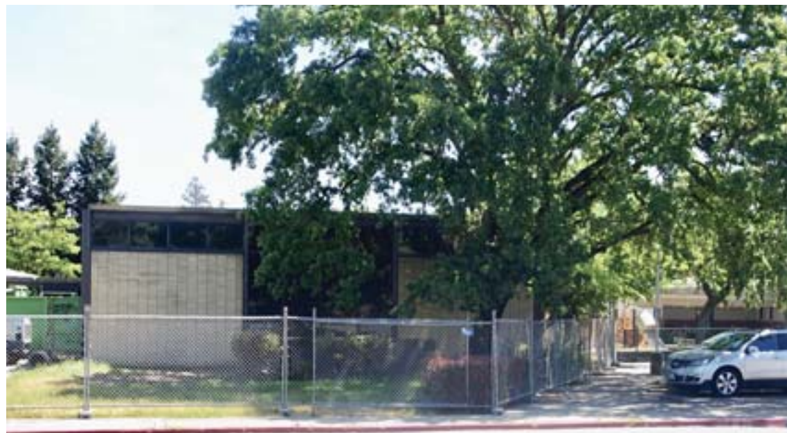
Demolition is planned for the end of May