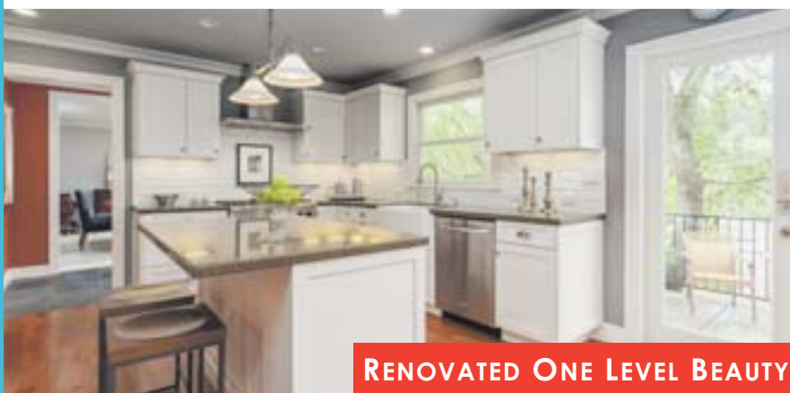
RENOVATED ONE LEVEL BEAUTY