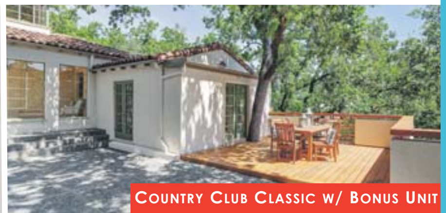
COUNTRY CLUB CLASSIC W/ BONUS UNIT