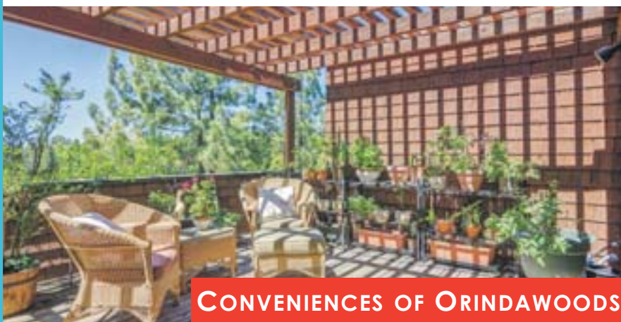
CONVENIENCES OF ORINDA WOODS