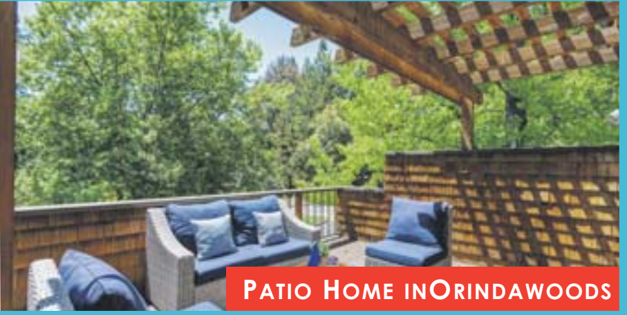
PATIO HOME IN ORINDA WOODS