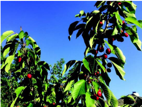
Bing cherries make great pies, jams, and brandied cherry desserts.