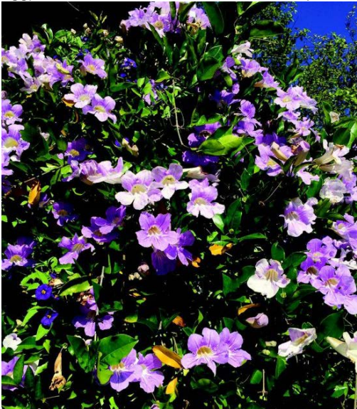
A purple trumpet vine attracts hummingbirds.