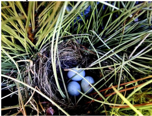
Three tiny eggs in a sparrows nest in Cynthia Brian's door wreath.