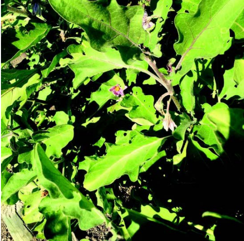
Eggplant blossoms forecast a bountiful crop.