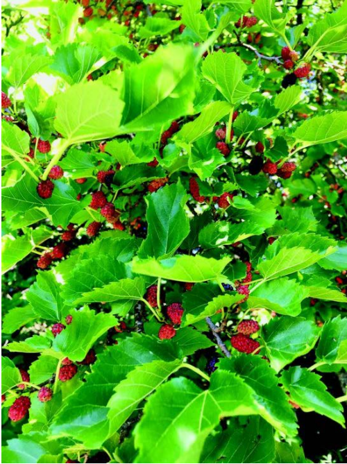
Branches of red mulberries are devoured by the birds and deer.

Happy Gardening. Happy Growing! Happy Independence Day!