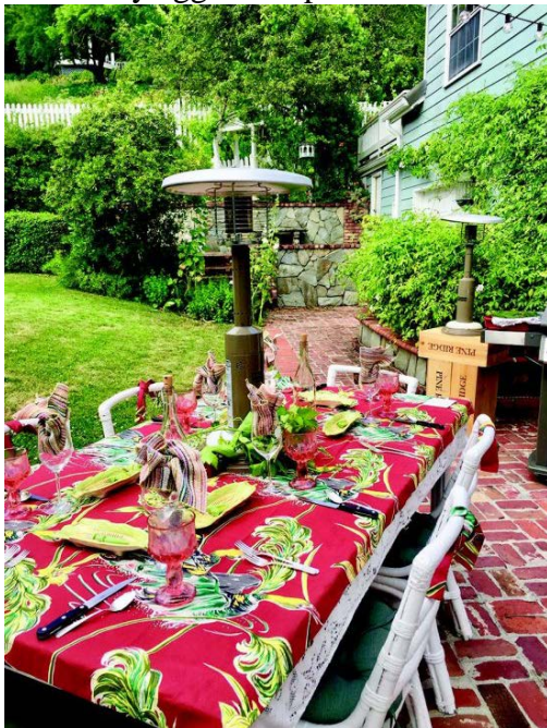
Set a pretty table outdoors for al fresco dining and add a gas heater for warmth.