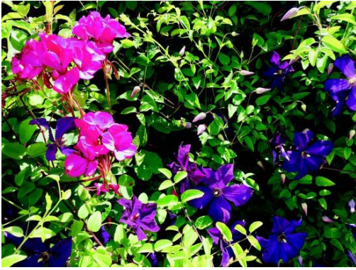
Pink geranium and purple Nelly Moses clematis are excellent bed partners.