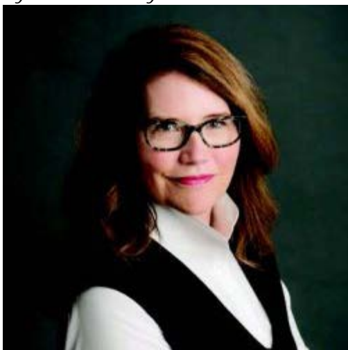
Julia Flynn Siler, Author

The topic at June's Sweet Thursdays author talk at the Lafayette Library and Learning Center was anything but sweet. New York Times bestselling author and Wall Street Journal former staff writer and currently contributor Julia Flynn Siler discussed her new book, "The White Devil's Daughters," which chronicles the stories of several young Chinese women sold as sex slaves in San Francisco's Chinatown throughout the 19th century, including after the abolition of slavery.